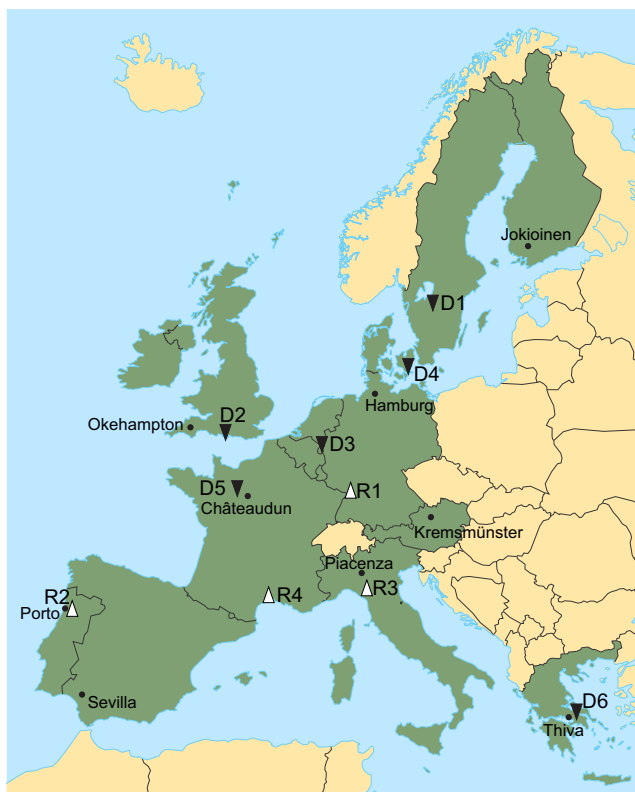
Fig. 2 Location of FOCUS groundwater (bullet) and surface water (black down-pointing triangle = drainage, increment = runoff) scenarios. Adapted from FOCUS 2000, 2001

According to monitoring results, detections of pesticide residues in the environment largely reflect use patterns, which underlines the importance of good agricultural practices (e.g., dosage and timing). Hence, guidance tools and stewardship represent further essential approaches to increase the sustainability of pesticide use by raising awareness among farmers. Existing web-