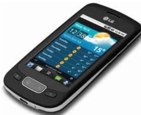
Figure: Selection of a smartphone for field use should give priority to battery capacity to allow full working days. Price is another relevant factor as field usage usually will be rough.

Although smartphones are still expensive, the availability of an open source operating system, the Android, is an advantage that any producer can use in their products. This is likely to push prices down quite rapidly and give way for easy affordability to Indian farmers.