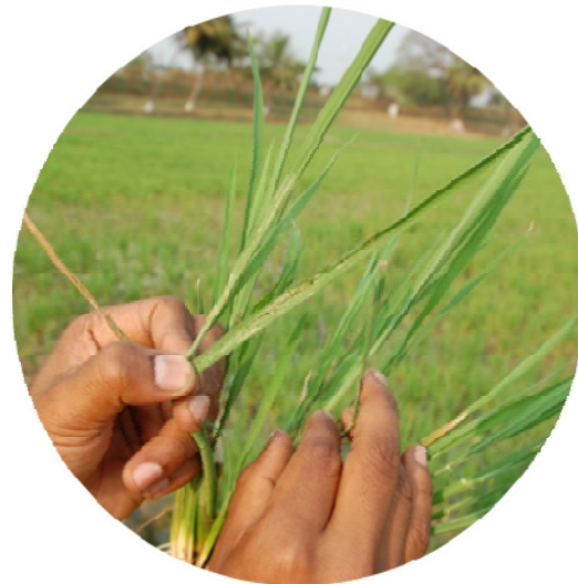
Photo: Early detection of pest damage on rice leaves

Farmers deal with day to day variability in weather conditions. This adaptation of farmers, e.g. towards weather forecasts, could be viewed as a short term analogy to the long term adaptations to climate change. Improved access to weather forecasts and other relevant warnings of weather driven events relevant to rice cropping is another priority of ClimaRice II.