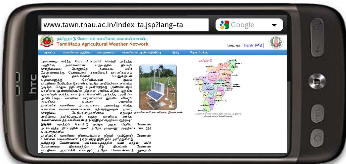
Figure: TamilNadu Agricultural Weather Network web page shown in a smartphone internet browser (in Tamil language)