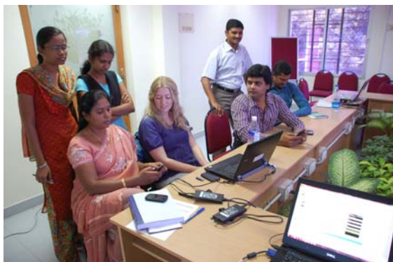
Photo: Mobile technology workshop

The major advantages of a work flow based on mobile field data collection is that the sampled data can be directly posted from the field and stored in an online central database, reducing the risk of data loss. The integrated support for determining geographical position (GPS) automates the procedure of associating such information with the observations taken. The location information can also be used for quality control, e.g. to check whether the observations are taken in accordance with a predefined sampling plan. In addition to improving quality and efficiency of field data collection, we expect to gain further valuable experience about performance of mobile phones under tropical field conditions. Important aspects that will be considered are battery capacity under operational data collection, network coverage, screen visibility etc.