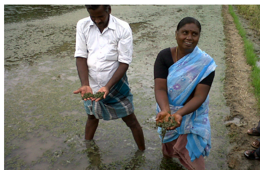
Blue green algal blooms in a Clima Rice farmer field, Trichy

Experiments were carried out at Agricultural College and Research institute, Trichy, TN, India during October- January, 2011 to study the algal succession in rice soil besides quantifying the biomass generation potential of different cyanobacterial species isolated from Cauvery basin. The cyanobacterial isolates were belonging to the genera Nostoc , Anabaena , Westiellopsis and Plectonema and composite inoculum of these cultures were inoculated @ 4 Kg per acre. The three main heterocystous genera ( Anabaena , Westiellopsis , Nostoc ) responded differently to levels of irradiation. Higher abundance of Nostoc coincided with lower abundance of the other two genera. Anabaena was the first cyanobacterial species to develop in field two weeks after transplantation of rice. Kannaiyan (1990) reported that nitrogen fixing forms namely Scytonema , Aulosira , Nostoc , Aphanotheca , Oscillatoria , Plectonema were dominant during tillering phase of rice crop. Gleotrichia and Rivularia were reported to occur during panicle initiation and flowering phase of rice. Many rice-field soils not only contain a high density of cyanobacteria, but possess visually obvious growths of cyanobacteria at (or floating above) the surface, during most part of the growth stages. Some of the common rice field cyanobacteria are Anabaena , Aulosira , Calothrix , Gleotrichia , Cylindrospermum , Nostoc , Fischerella , Scytonema , Tolypothrix and Wolleea (Rai et al. , 2000).