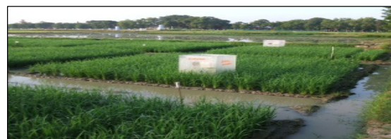
Fig. 3. Experimental field with methane collection chamber

Plant-mediated CH 4 emission flux from the experimental plots was measured by closed chamber method of Adhya et al. (1994) at regular intervals from transplanting to harvest. Samplings for CH 4 flux measurements were made at 09:00-10:00 hours and 15:00-16:00 hours and the average of morning and evening fluxes were used as the flux value for the day. For measuring CH 4 emission, eighteen rice hills were covered with a locally-fabricated transparent acrylic sheet chamber (59.3 cm length, 59.3 cm width and 87.8 cm height). A battery-operated fan was fixed for air circulation (avoid plant suffocation) to mix the air inside the chamber and draw the air samples into air-sampling bags (Tedlar®). The air samples from the sampling bags were analyzed for CH 4 . Each chamber was placed on the soil surface with 4-5 cm inserted into the soil, 10 minutes prior to each sampling for equilibration to reduce the disturbance to the sampling site.