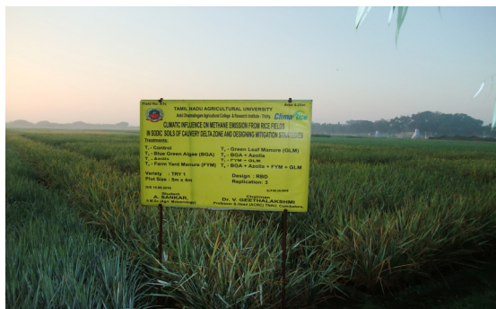
Fig. 2. Overview of experimental field

After 24 hours of fungicidal treatment, the seeds were treated with Azospirillum @ 600 g ha -1 of seeds. The treated seeds were soaked in water for 24 hours to induce sprouting. The sprouted seeds were sown uniformly in the well prepared nursery maintaining thin film of water.