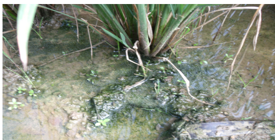
Fig. 6. Blue green algal mat in paddy rhizosphere

Recently, it has been reported that growing Cyanobacteria in rice fields results in sequestering carbon. Cyanobacteria are attractive candidates in this respect as they are fast growing and easier to manipulate in open ponds. They possess an essential biophysical mechanism (carbon concentrating mechanism, CCM), which concentrates CO 2 at the site of photosynthetic carboxylation. In this respect the carbon concentrating mechanism (CCM) in cyanobacteria is similar to that found in C 4 land plants. This enables them to maintain high rates of CO 2 fixation, and also grow under low CO 2 (Badger and Price, 2003). The pioneering studies of Kaplan et al. using Anabaena variabilis , demonstrated that cyanobacteria were capable of accumulating inorganic carbon, to such an extent that intracellular concentration could be 1000 folds more than the external environment. Since then DIC (Dissolved Inorganic Carbon) accumulation has been demonstrated in many cyanobacterial strains e.g. Cocochloris peniocystis , Anacystis nidulans , Chlorogloeopsis sp. , Nostoc calcicola etc. Cyanobacteria are