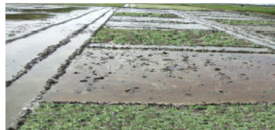
Fig. 1. Experimental applied with green leaf manure and farm yard manure

To study the role of biofertilizers such as Azospirillum, Blue Green algae and Azolla on nitrogen supplementation and rice yield a field experiment was carried out in the 'A1C' block of farm of Anbil Dharmalingam Agricultural College and Research Institute, Trichy during June-September, 2010. The farm is situated at 10°45'N latitude, 78°36'E longitude and at an altitude of 85 m above mean sea level. The experiment location having the climate of Semi-Arid Tropics experiences a mean annual rainfall of 843 mm distributed over 48 rainy days. The mean maximum temperature and minimum temperature are 34.8°C and 24.7°C respectively. The relative humidity ranged from 87 to 96 per cent in the forenoon and 66 to 87 per cent in the afternoon. The soil of the experimental field was sandy clay loam, taxonomically classified as isohyperthermic Vertic Ustropet, having 191 kg ha -1 of available nitrogen, 27.5 kg ha -1 of available phosphorus and 240 kg ha -1 of available potassium. The rice variety TNAU (R) TRY1 was chosen for the study and it has duration of 135 days. The Green manure Sesbania aculeata was raised in a separate field and incorporated in the field as green leaf manure before planting as per the treatment.