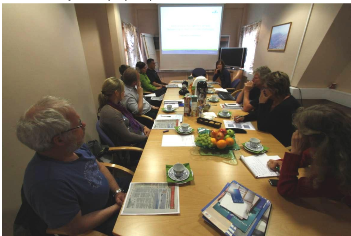
Tjøtta on the 2<sup>nd</sup> of September 2010