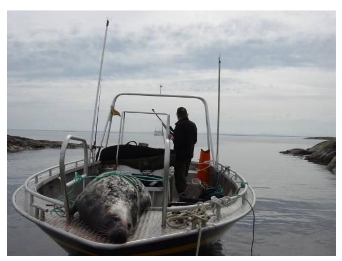
Coastal hunting on a smaller boat

Coastal hunting is considered a demanding form of hunting, and an approved examination for big game hunting is required.