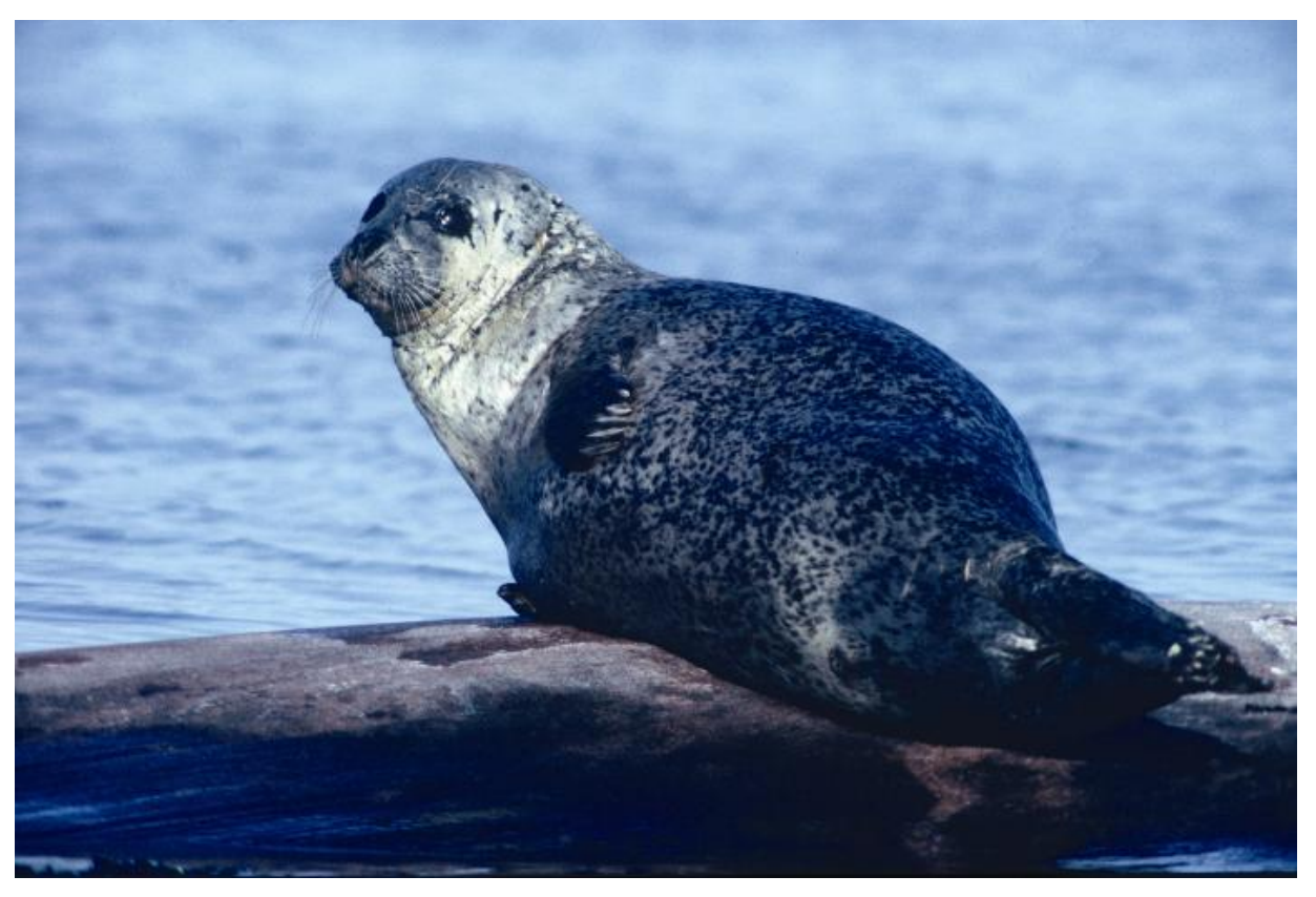
Common seal

collapses when countries talk about banning seal products". Environment Minister Daniel Shewchuk, claims that there is a common misconception that an exemption protects Inuit. He points to the pointlessness of these exemptions in the 1980s as a result of the EU ban on white-coats. As hunt on white-coats was banned, they included an exemption for the Inuit. However, the market fell through and the Inuit communities still suffered. The fear is that this new import ban will have similar repercussions and again put a strain on the sealing industry.