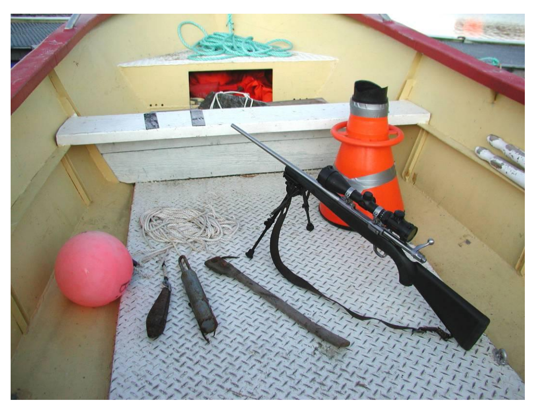
Hunting gear for coastal hunting

Commercial sealers in Canada fall into two categories: landsmen and offshore sealers, depending on where and how they hunt. The landsmen hunt involves smaller boats and takes place close to land (usually no more than 15 miles offshore). The boats are returning to shore every night. The offshore hunt involves bigger vessels of 35-65 feet in length, most being closer to 65 than 35 feet. Offshore sealers often follow seal herds and may travel 100 miles or more on trips that take up to two weeks. These two categories are comparable to the Norwegian categories of coastal hunting and sealing on ice.