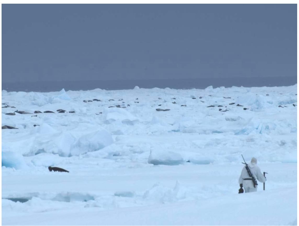
Hunting adult, harp seal

Boycotts against Norwegian sealing during the 1980's, resulted in a changeover in the industry as it became less economical viable. That is why since 1991, Norwegian sealing has been subsidized by the government in order to survive as an industry. The survival of the industry is considered to be important to ensure a safe management of the seal population. In addition, it keeps the traditions and knowledge of sealing alive so that one will be able to govern the population in an appropriate fashion in the future. At the same time there is an innovative focus on developing new seal products that will allow for a more self-sufficient industry.