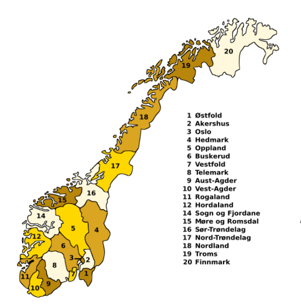
Figure 1. Map of Norway with 20 counties<sup>2</sup>.

The five main regions of Norway are Sørlandet (counties Aust- og Vest-Agder), Vestlandet (Rogaland, Hordaland, Sogn og Fjordane), Østlandet (Oslo, Akershus, Østfold, Vestfold, Buskerud, Telemark, Hedmark, Oppland), Midt-Norge (Møre og Romsdal, Sør-Trøndelag, Nord-Trøndelag) and Nord-Norge (Nordland, Troms, Finnmark). However, these regions have no political function, and various regions exist for various purposes such as communication and health service. For example, Møre og Romsdal county (No. 15 in Fig. 1) is sometimes regarded as belonging to Vestlandet. Around 2005, a regional reform was much debated. The aim was that the current counties, which currently all have their own administration and political councils, should be replaced, or supplied by a regional level. However, as long as several different regions exist in parallel, it was very hard to agree on which regions would be optimal for all purposes. Hence, Norway sticks to its old system of municipalities (in total, 431 in 2007; 430 in 2010), counties and the national level.