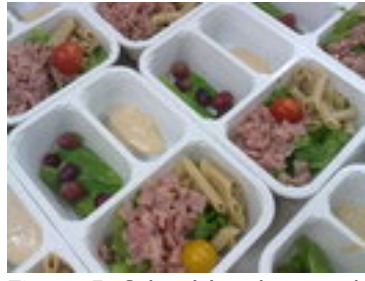
Figure 5. School lunch served at one of the schools participating in the "skolematen.no" food service, showing the containers and the food (pasta salad).

As mentioned for Rissa municipality in section 3.1, "skolematen.no" is a newly established company specialised to organize very flexible subscription schemes for school meals. So far, four schools in three different counties participate, from Oslo to north of Trondheim<sup>47</sup>. Prices, menus and the flexibility of the subscription scheme vary from school to school. For each school, a local caterer is found, and the menu is planned together with the school meal company, which ensures the quality of the meal. An example from a meal served in one of the schools in Rissa in May 2010 is shown in Fig. 5. The meals are packed in recyclable plastic containers and brought warm to the schools.