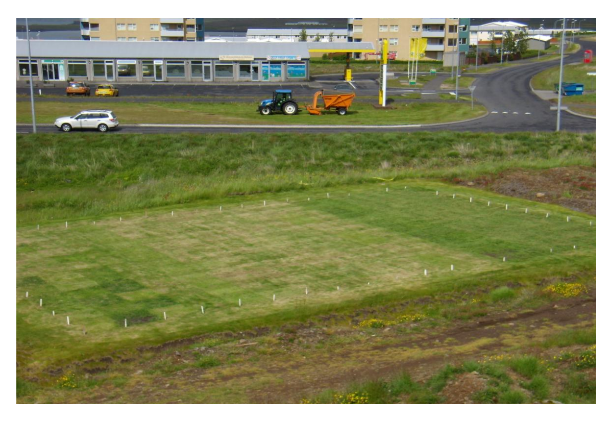
Photo 5. The experimental green at Keldnaholt, 22 June 2009.