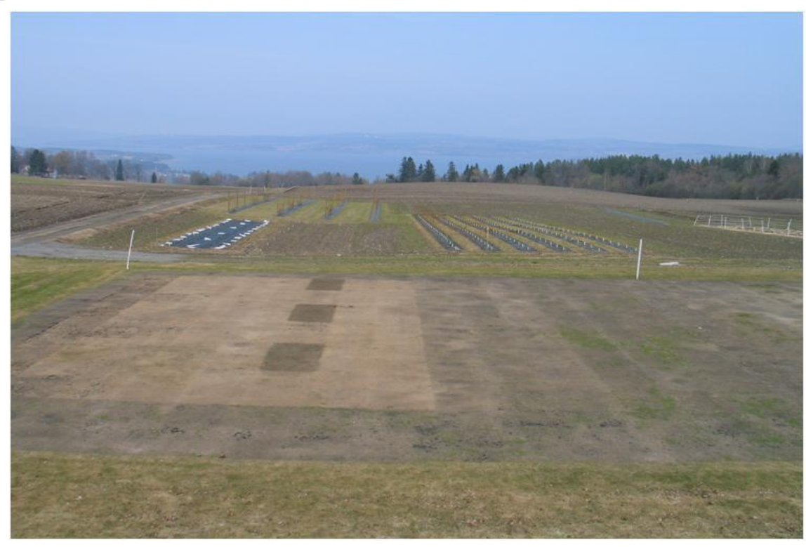
Photo 1. Winter killed green at Apelsvoll, 24 April 2009.