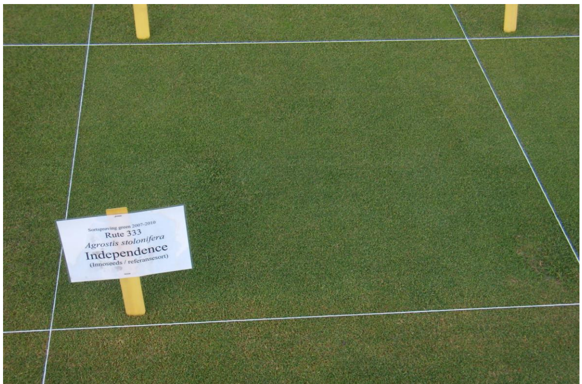
Photo 11. Creeping bentgrass 'Independence' at Landvik, 2 September 2009.