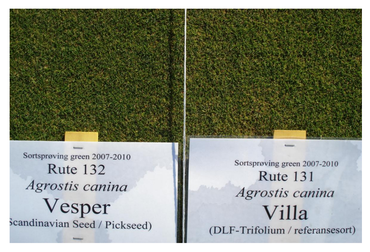
Photo 10. 'Vesper' is darker than 'Villa'. Landvik, 3 September 2008.