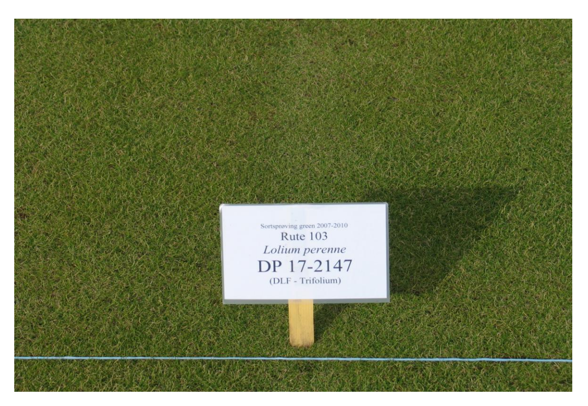
Photo 14. 'Chardin' (DP 17-2147) was ranked significantly before the other perennial ryegrass varieties in climate zone 1 and 2. Apelsvoll, 17 September 2008.