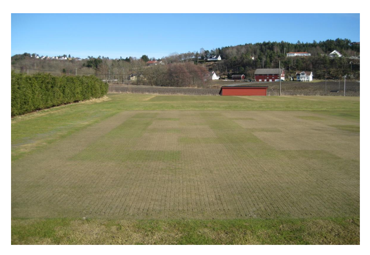
Photo 4. Good over wintering at Landvik, 17 Mars 2009, five days after snow melt. Plots with green colour in the first and second column are perennial ryegrasses. In the third, fourth and fifth column slender creeping red fescues and to the far right rough-stalked meadow grass. Other, mostly dormant plots chewings fescues