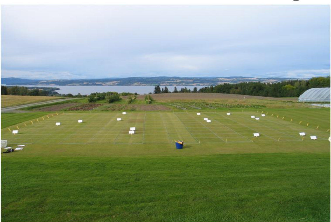
Photo 3. Re-sown (19 May) green at Apelsvoll, 17 September 2009.