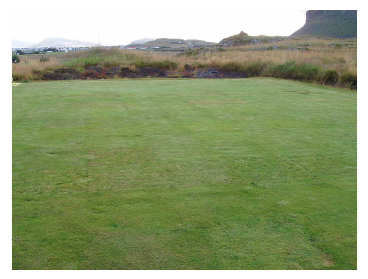
Photo 8. The variety green at Keldnaholt, 18 August 2009. The mowing height was 5.5 mm for all species.

Photo 7. Aerification with Verti Drain before the winter at Apelsvoll, 7 October 2009.