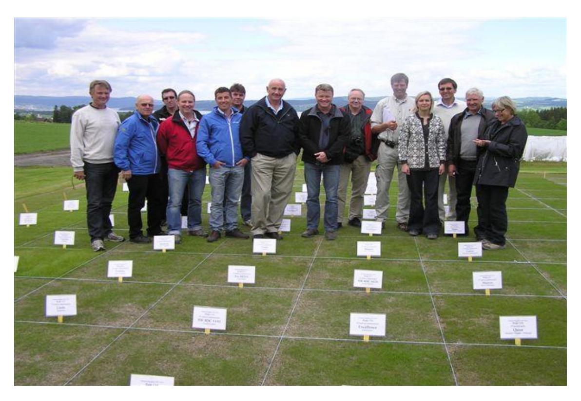
Photo 2. Re-sown (19 May) green and STERF Velvet bentgrass project reference group meeting at Apelsvoll, 9 June 09.