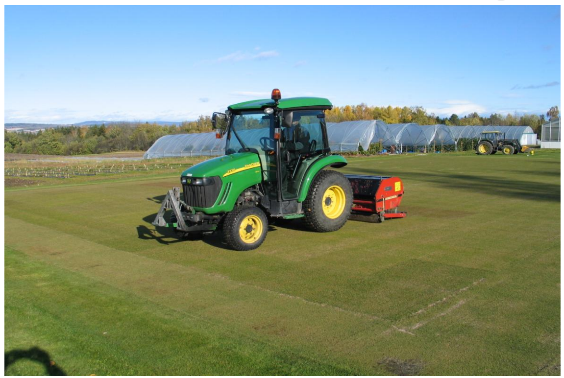
Photo 7. Aerification with Verti Drain before the winter at Apelsvoll, 7 October 2009.