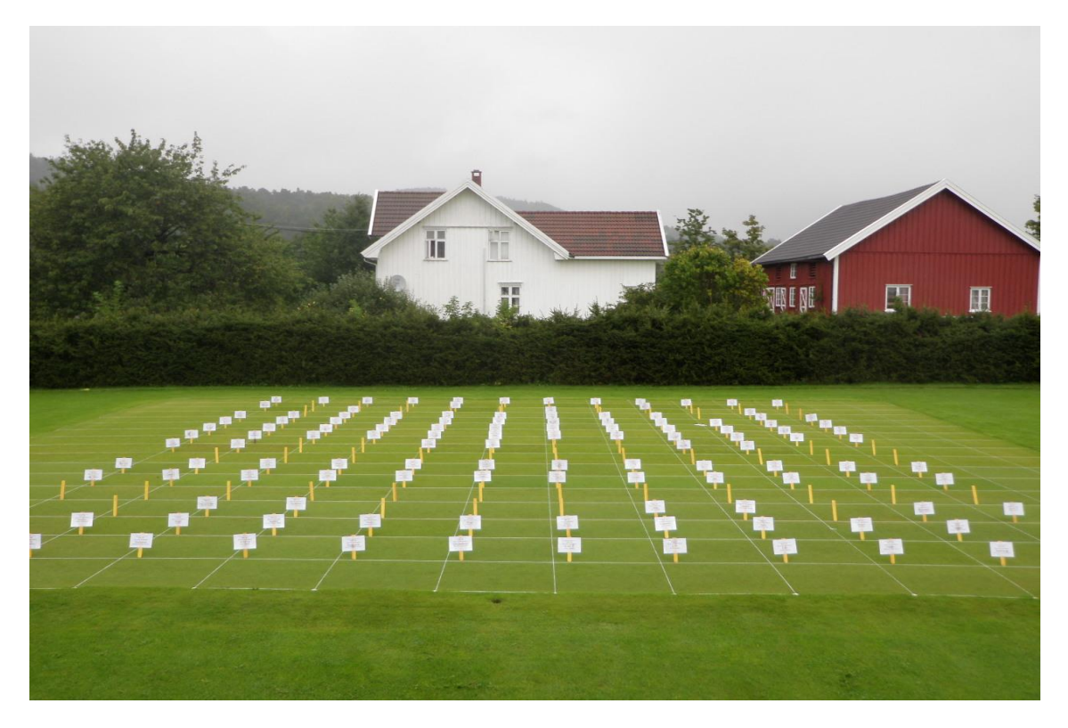
Photo 6. The variety green at Landvik, 2 September 2009.