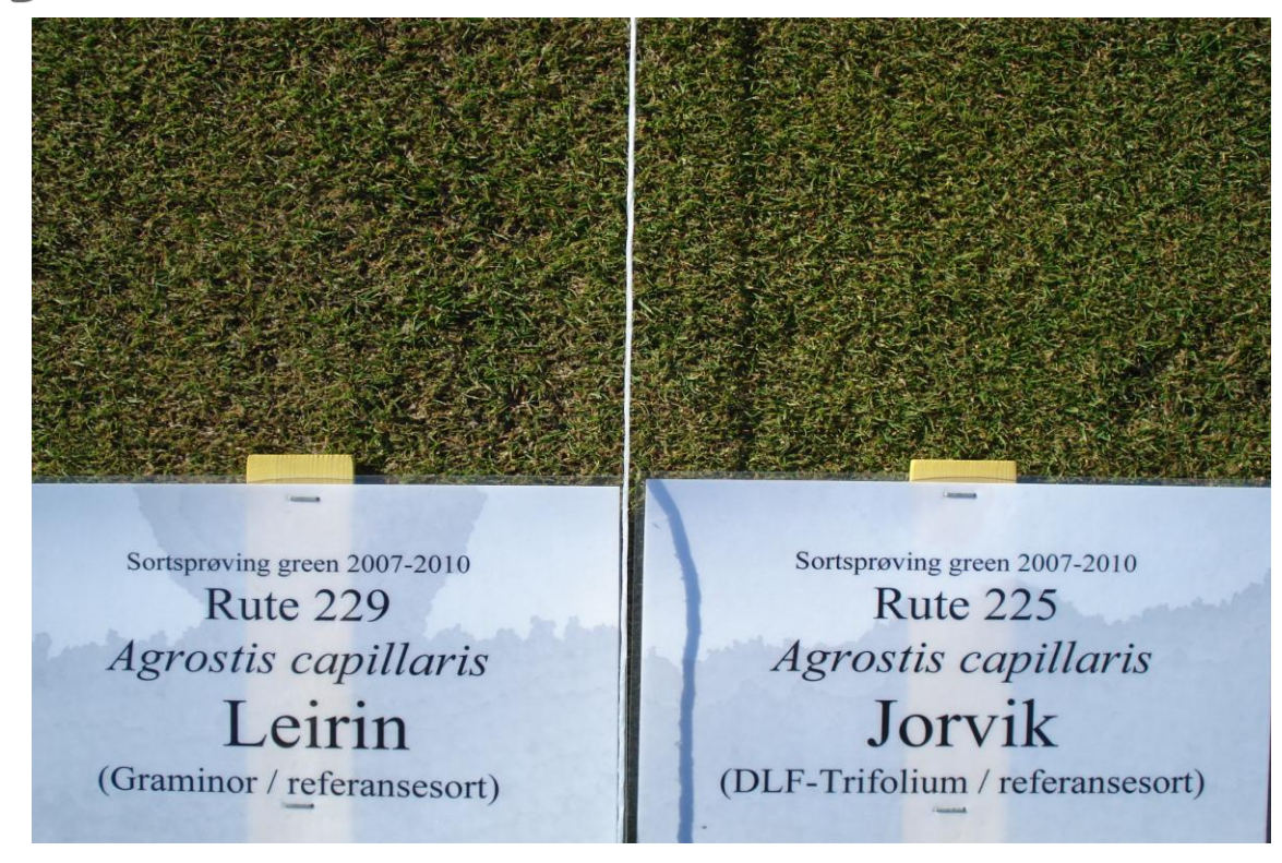
Photo 9. 'Leirin' has wider leaves and lower density than 'Jorvik'. Landvik, 3 September 2008.