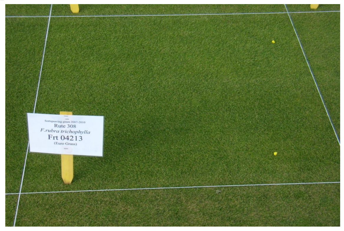
Photo 13. Slender creeping red fescue 'Finesto' (Frt 04213) at Landvik, 2 September 2009.