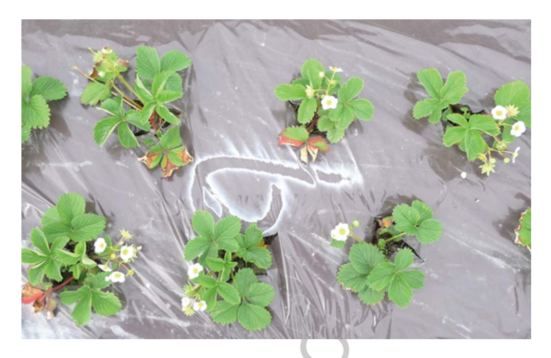
Fig. 3. Open field flowering in 2013 of 'Sonata' bare root A15 plants in Mid-Norway.