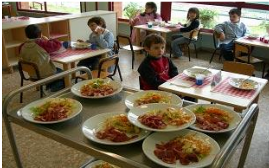
Lunch in an Italian school.