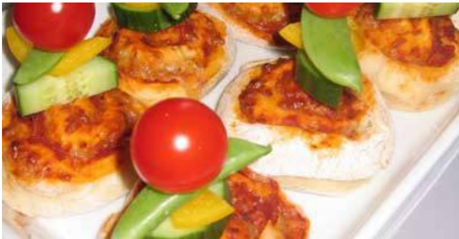
Organic school food for sale in Copenhagen, Denmark

In order to strengthen the organic sector, the Danish government in 1997 decided to allocate 5 million € and later additional 1,5 million € to the introduction of organic products purchased by the local municipal authorities. The initiative was called 'Grønne Indkøb' (GI) - green procurement. Today, this support and the resulting implementation processes are regarded as one of the most significant instruments for realizing the goals of increased organic consumption. One example of local initiatives is the "Healthy School meals in Copenhagen" (KØSS) program, which was initiated by the municipality of Copenhagen. The aim of this program is to encourage pupils to develop healthy eating habits. From the beginning of the project the plan was that by 2008, 75 % of the food is intended to be organic. This goal was later postponed to 2011. In 2008, approximately 50 % of the school food in Copenhagen was organic, while the share in kindergartens and nurseries was respectively 75 and 85 %.