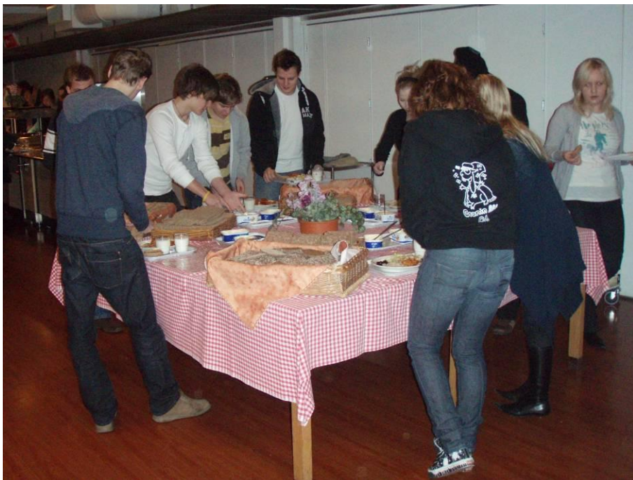
Finnish youth helping themselves to bread in the lunch.

Science based evolving use: Some catering organizations have started to orientate their meal services towards sustainable production based on scientific evidence. They take into account healthy nutrition, environment and social well being with regard to food chain actors as well as to customers. In this perspective, they consider organic/local food as more sustainable than food from conventional production and trade. As some very large companies are involved, the impact of this strategy for public catering might have considerable leverage (Mikkola, 2008; 2009a).