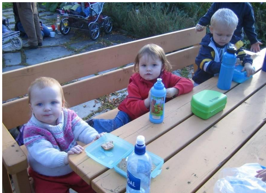
Norwegian children are adapted to a packed lunch from an early age.

In general, the interest for organic consumption is rapidly increasing among Norwegian consumers. Each year new organic products are introduced into the food market. On some products, especially imported like coffee and bananas the premium prices have decreased. On other products, e.g. organic school milk, they are still very high.