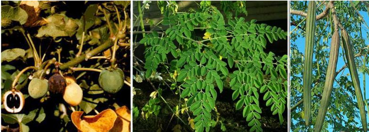
Left: Fruits of the Jatropha plant. Middle: Moringa leaves, and right: Moringa fruits.