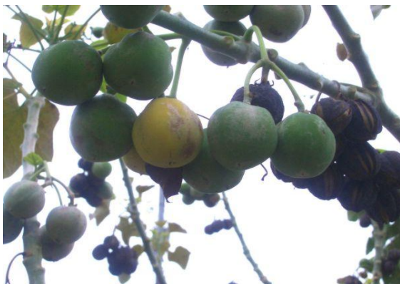
Jatropha fruits in West Africa

The Jatropha system creates a positive reciprocity between raw material / energy production and environment / food production; e.g. the more energy Jatropha hedges produce the more food crops are protected from animals and erosion.