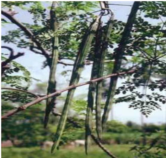
A. de Saint-Sauveur

Like Jatropha Moringa tolerates a wide range of soil and rainfall conditions. Minimum annual rainfall requirements are estimated at 250 mm with maximum at over 3000 mm. The presence of a long taproot makes it resistant to periods of drought. It can perform well on most degraded soils and can therefore be useful in combating land degradation.