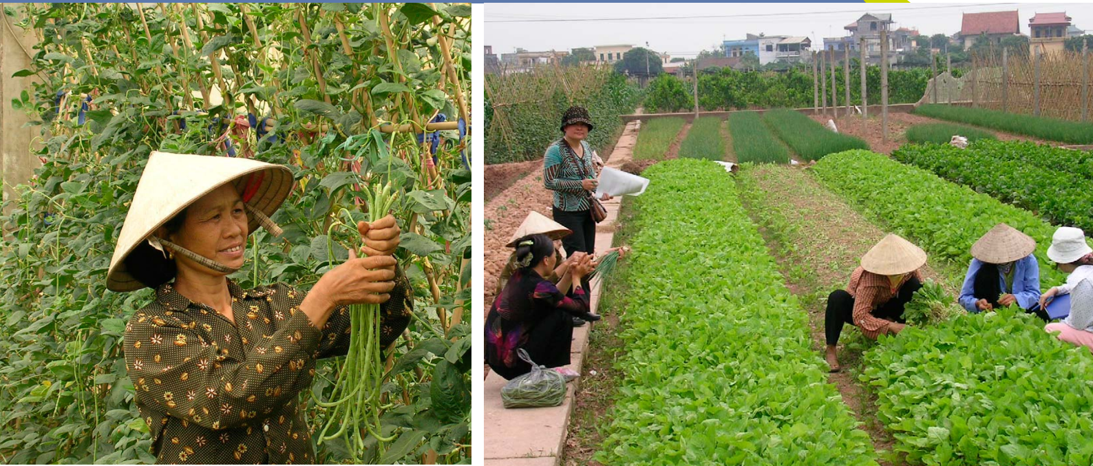
Figure 2. Sampling of long beans and leaf mustard and interviews of farmers by NPCC personnel.