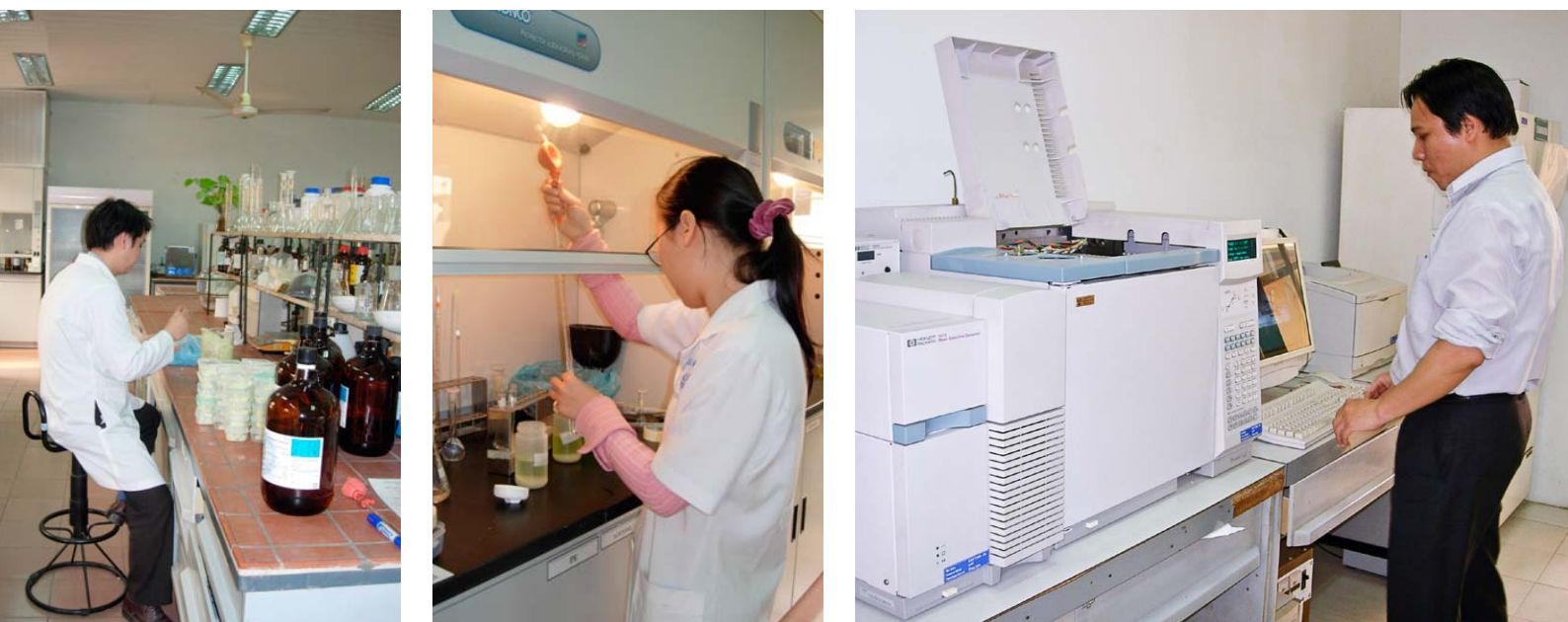
Figure 3. Vegetable sample preparation at NPCC with the new method: homogenisation, extraction, centrifugation and analysis.

time by personnel from NPCC and 24 samples of each crop were sampled. The samples were analysed for pesticide residues at NPCC using the new multi-residue method. The homogenized vegetable samples were then shipped on dry ice to Bioforsk for pesticide residue analysis with the Bioforsk GC-MS multi-residue method. The results from the analyses are summarized in Table 1.