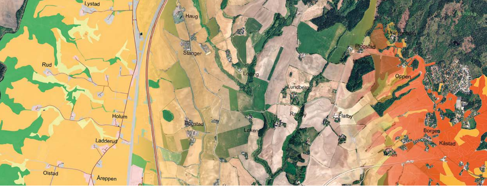
Data from "Kilden", NIBIO's map service. Montage