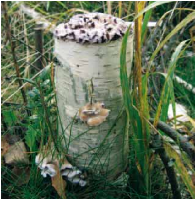
Fig. 2. Sporophores of Chondrostereum purpureum on birch stump. Birch stump was inoculated in May and the photo was taken in October.

27–43 % in August –October inoculations. In control stumps the sporophore frequency was 5 % (Table 1). Sporophores were found also in alder, rowan, aspen and willows.