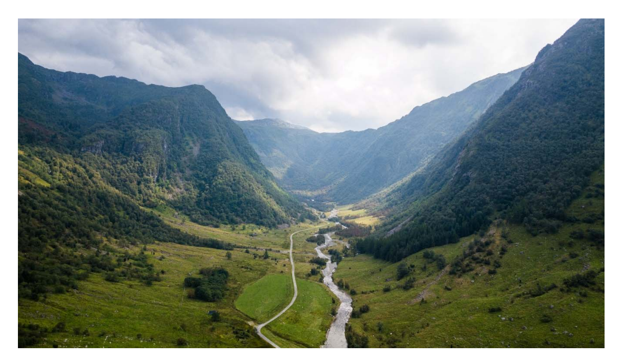
Figure 1. View of typical Norwegian farm pasture on the west coast, with some arable land (green near river) for silage.

In Norwegian coastal and fjord areas, a less intensive production system with less use of concentrates and more winter grazing could be a viable alternative. A well-managed hogget production system based on locally grown feeds and pastures can offer an opportunity for the farming industry to increase the availability of fresh meat and improve the regularity of cash flow throughout the year. It could make sheep farming more sustainable in terms of better economic performance, being more environmentally friendly, and being more efficient in terms of resource utilisation. Increasing demand for fresh meat year-round may favour production changes. Such extensive production systems will allow for more lambs and hoggets to be slaughtered in the winter and following spring.