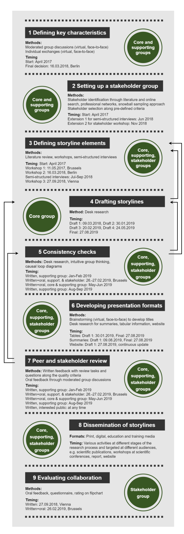
Fig. 1. Overview of the research process based on the nine working steps defined in the protocol by Mitter et al. (2019). Notes : For each working step (grey rectangle), the scenario working groups involved (green circles), the applied methods and the timing are given. The arrows indicate that the research process was iterative, i.e., some working steps were repeated until the final Eur-Agri-SSPs were developed. (For interpretation of the references to colour in this figure legend, the reader is referred to the web version of this article.)

data and resources. Additional information and material for specific working steps is provided in the Supplementary Material (SM II).