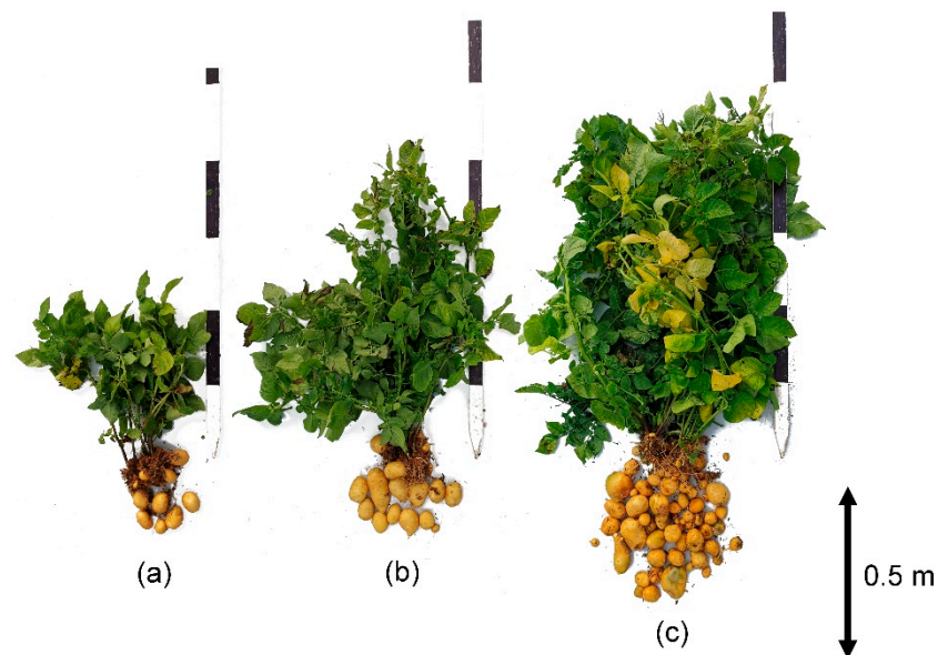
Figure 3. Potato plants (one per group) produced at various fertigation rates: (a) 3 min, (b) 6 min and (c) 20 min.