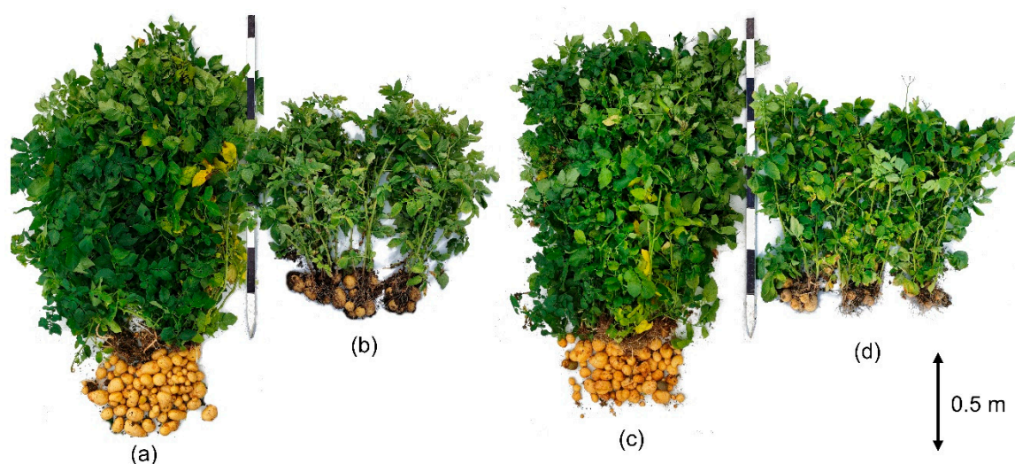
Figure 1. Potato plants and tubers (three per group) produced in the wood-fiber-based hydroponic system (a,c) and in the field (b,d).

Compared to the field reference, the plants grown hydroponically were approximately two times larger (Figure 1). The difference in biomass between the two tested substrates was minimal, with 150 cm long shoots and 9 and 8 shoots for HUN and PIN, respectively. Higher yield was observed when growing in PIN fiber ( 1877 \text{ g plant}^{-1} ) than when growing in HUN ( 1537 \text{ g plant}^{-1} ) (Table 1). Compared to the field-grown potatoes, the yields of the hydroponic production were larger by more than 200% (Table 1). Dry matter in the hydroponic-grown tubers was considerably lower than in the field-grown tubers, yet DM production on a per plant basis was still higher in the hydroponic system.