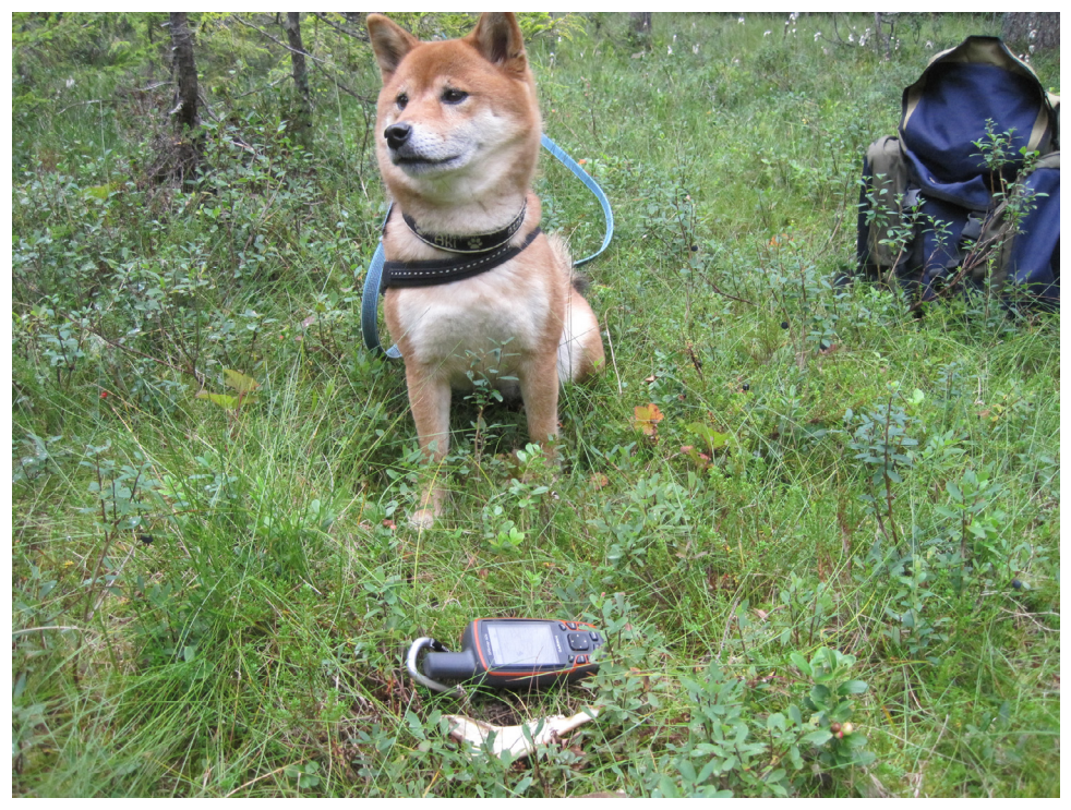
Figure 1. A carcass detection dog during a field trial that has found an old bone from a sheep. The GPS position (universal transverse mercator projection (UTM) coordinates) of the carcass is logged.