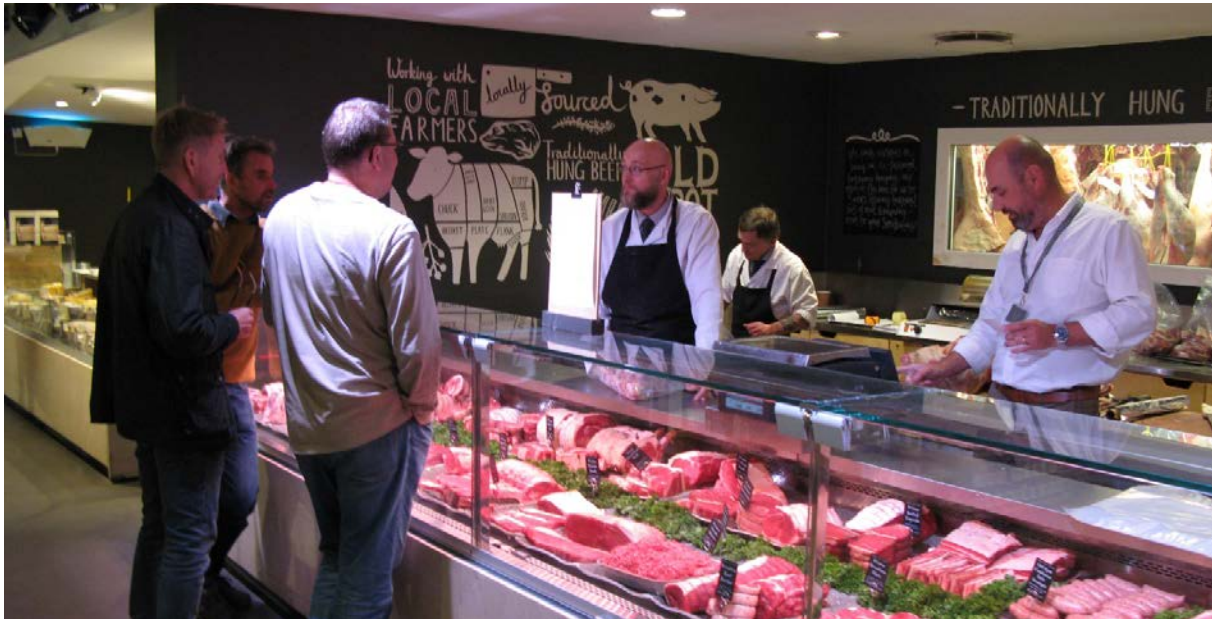
The professionalism and range of local stock at the motorway service station was perceived as impressive. Its prices seem not to discourage customers seeking food quality or stories about supplier farms.