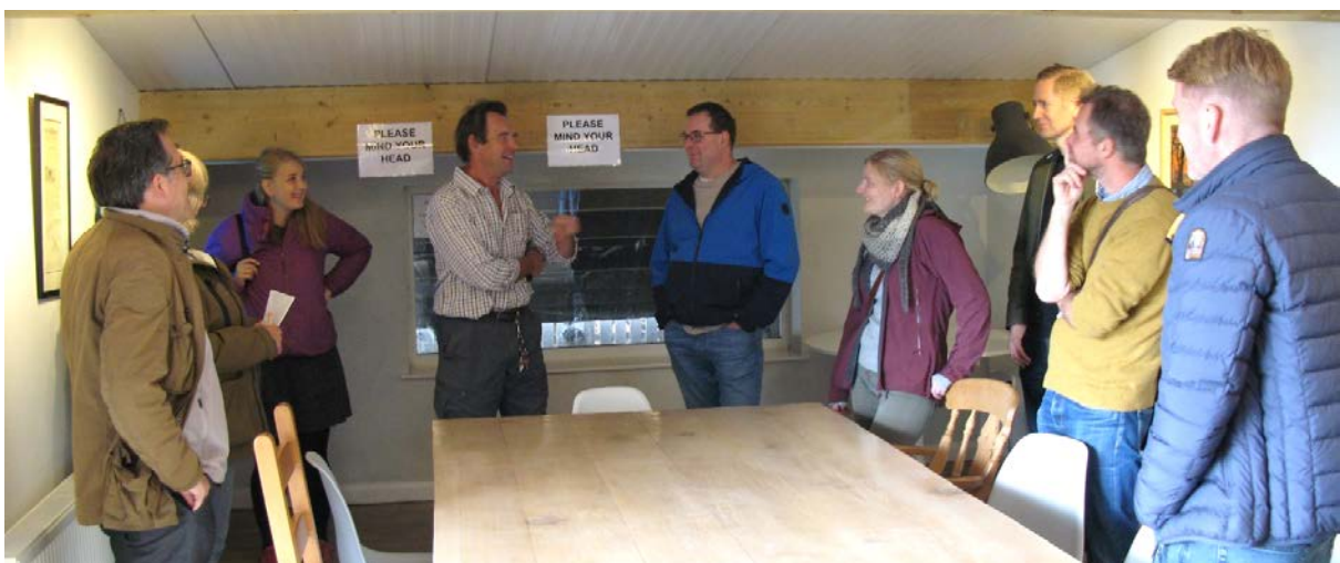
Encounters between Norwegian and English farmers turned out to be informative for both and were characterised by a deep mutual understanding – quite interesting to observe for attending researchers!

The dairy producer was weighing up the benefits of remaining certified organic after more than 20 years, now that some of the rented agricultural land is to be used for other environmental initiatives, such as tree planting. The consequent reduction of grazing area may make it harder to feed cattle organically, while local branding is successfully creating a high demand for the product.