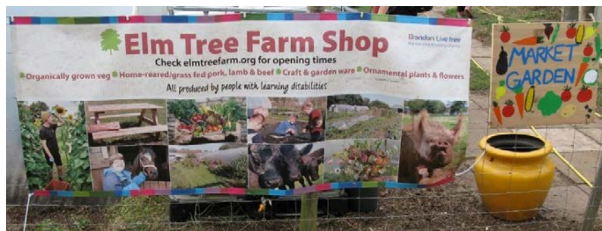
Different marketing models: Farmer in personal dialogue (with foreign fellows and researchers in this case), branding "on the road", handwritten information to shareholders, and local posters.