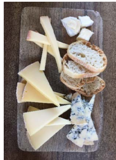
Production, retail and catering are essential elements of an urban food system.