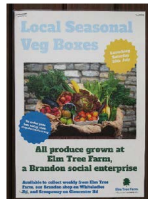
Explicit support of local producers in a grocery store, at a motorway service station, and through pick-up offers for veg boxes.