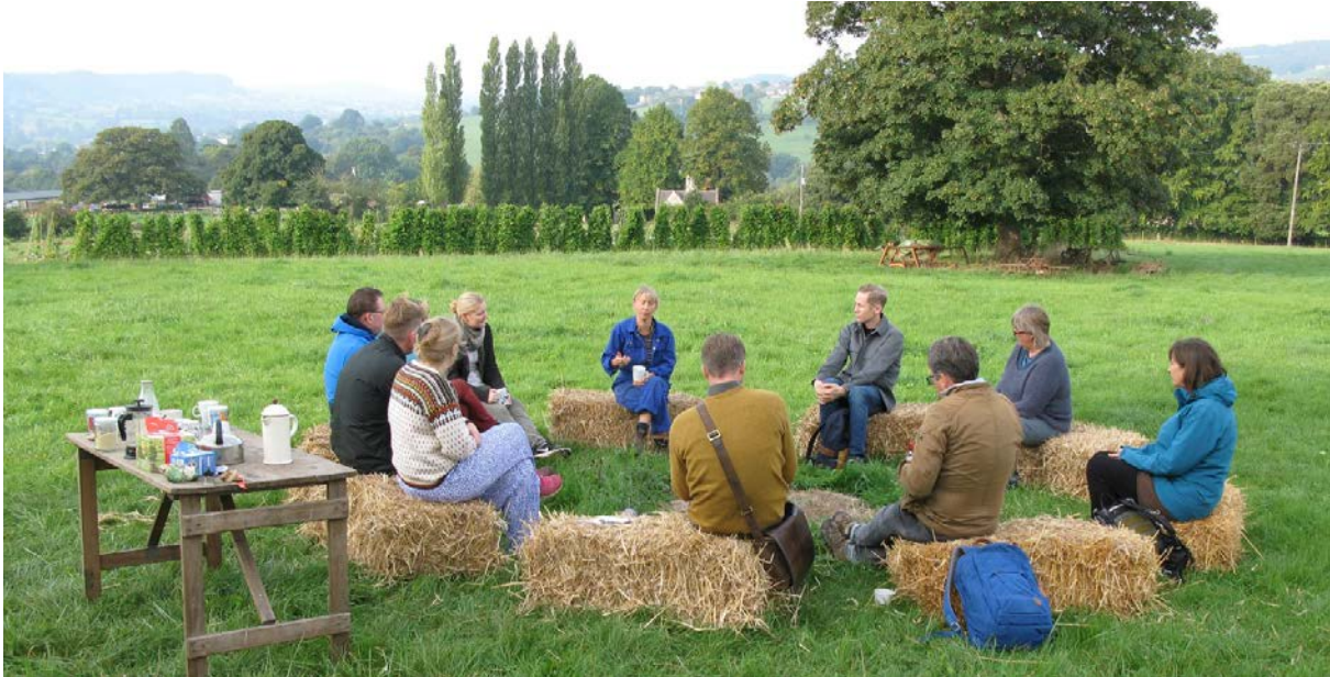
Challenges due to short-term lease contracts for farmland were among the topics discussed at the CSA farm.

promoting members' responsibility for participation in farm activities. Furthermore, despite the shareholder size, salaries for employed CSA staff are not regarded competitive with alternative career opportunities and fall short of regional cost of living requirements. The manager at the dairy farm highlighted Brexit as a challenge in recruiting employees, who previously included EU citizens, access to whom has now been restricted.