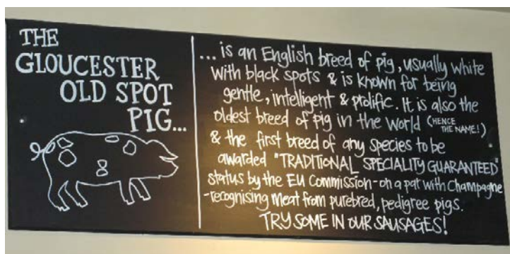
Piglet of a regional heritage breed at a CSA farm, and branding of the breed at a local restaurant.