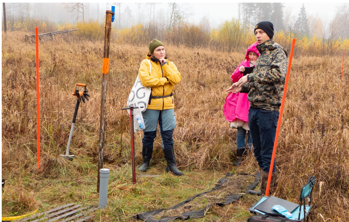
Figure 5 GHG emission measurement site