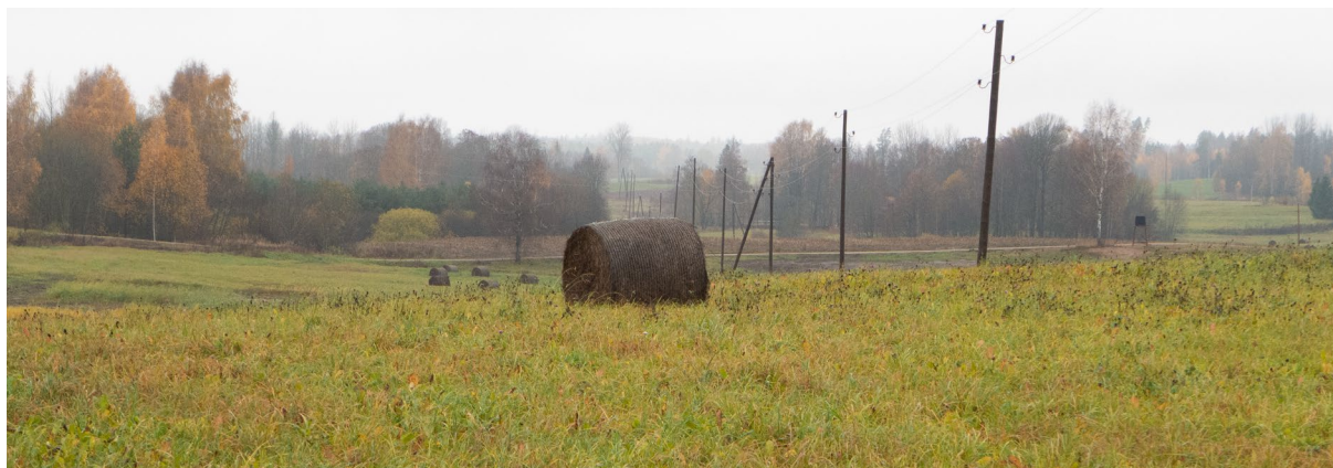
Figure 2 Latvian grass production