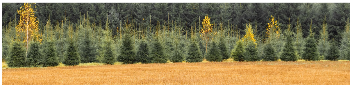
Figure 6 Latvian agricultural field