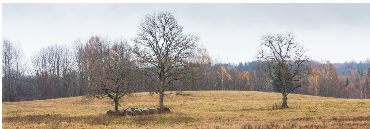
Figure 1 Latvian agricultural landscape

The agenda for the in-country mission is attached in the appendix.