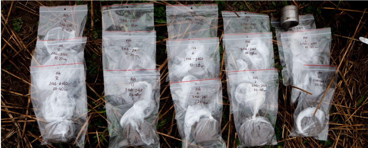
Figure 4 Soil samples

Analyzing the data and implementation in GHG Inventory report, together with a scientific report on the results, will be done by SILAVA by the end of 2023. The article is to be submitted by the end of January 2024. The scientific article is not yet ready.