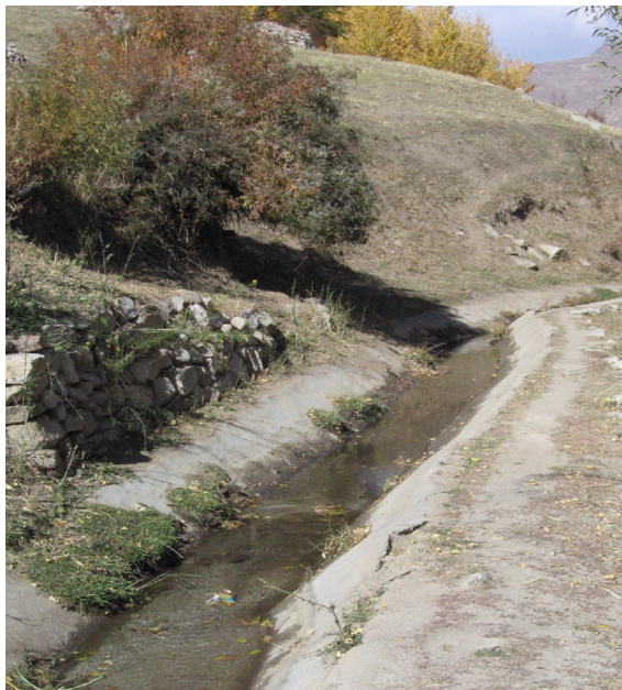
Fig. 4: An irrigation system made from concrete (Tajikistan).

During the Russian era the original irrigation systems were replaced by systems made from concrete (Figure 4). The last decade's maintenance of the irrigation systems has been badly resulting in collapse of the system in many places and again resulting in salinization, water shortages and erosion/land slides due to water leakage. Salinization occurs when water containing certain levels of salt is used for irrigation (Figure 5). The water is evaporating fast and the salts in the water crystallises in the topsoil. At the end salinized soil is unusable for agricultural purposes and restoring the situation is a long and difficult process.