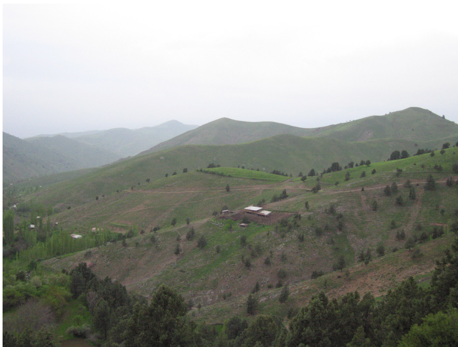
Fig. 6: An overgrazed area in Uzbekistan.

koi - Kyrgyzstan, Sary Chelek – Kyrgyzstan and Zaamin– Uzbekistan) were grazing animals are forbidden during a shorter/longer time. The effect on vegetation development and erosion features was clearly seen (Figure 7).