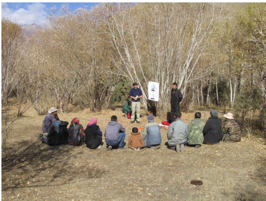
Fig. 12: Education in forestry management (Tajikistan).