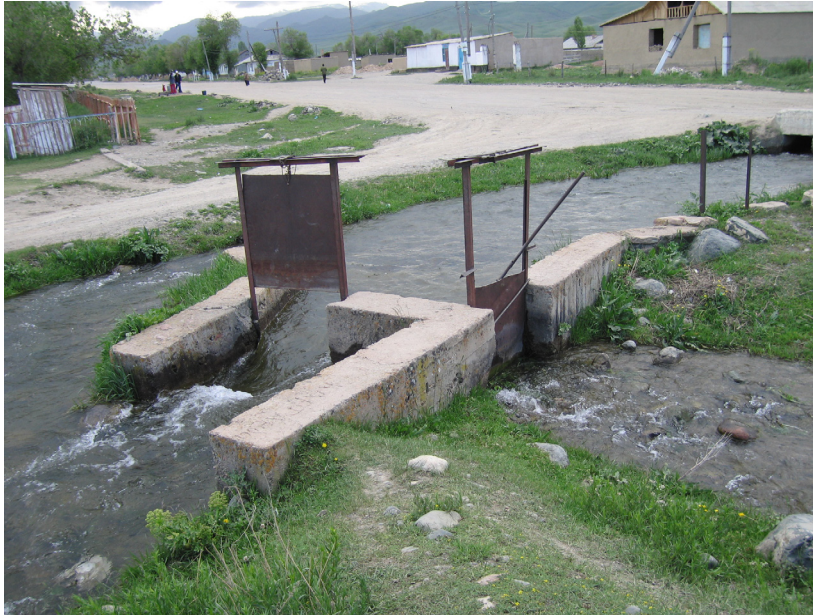
Fig. 3: An irrigation system from Talas, Kyrgyzstan.

During the Russian era the original irrigation systems were replaced by systems made from concrete (Figure 4). The last decade's maintenance of the irrigation systems has been badly resulting in collapse of the system in many places and again resulting in salinization, water shortages and erosion/land slides due to water leakage. Salinization occurs when water containing certain levels of salt is used for irrigation (Figure 5). The water is evaporating fast and the salts in the water crystallises in the topsoil. At the end salinized soil is unusable for agricultural purposes and restoring the situation is a long and difficult process.