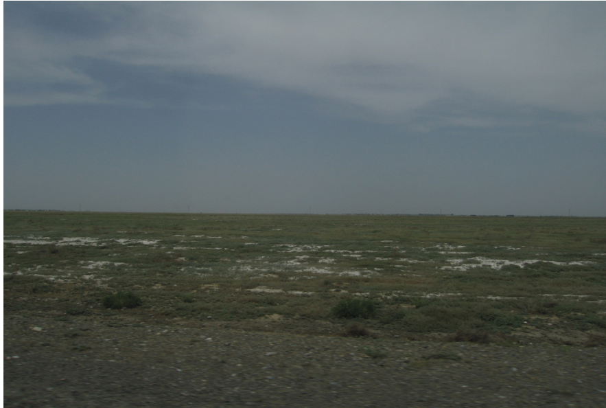
Fig. 5: Salinization (Uzbekistan).

Besides the maintenance of the irrigation systems 3 other water related challenges are actually in the area: