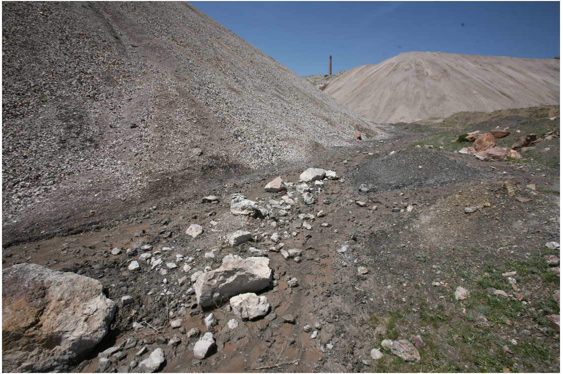
Fig. 10: Tailing in Khaidarkan (Kyrgyzstan).