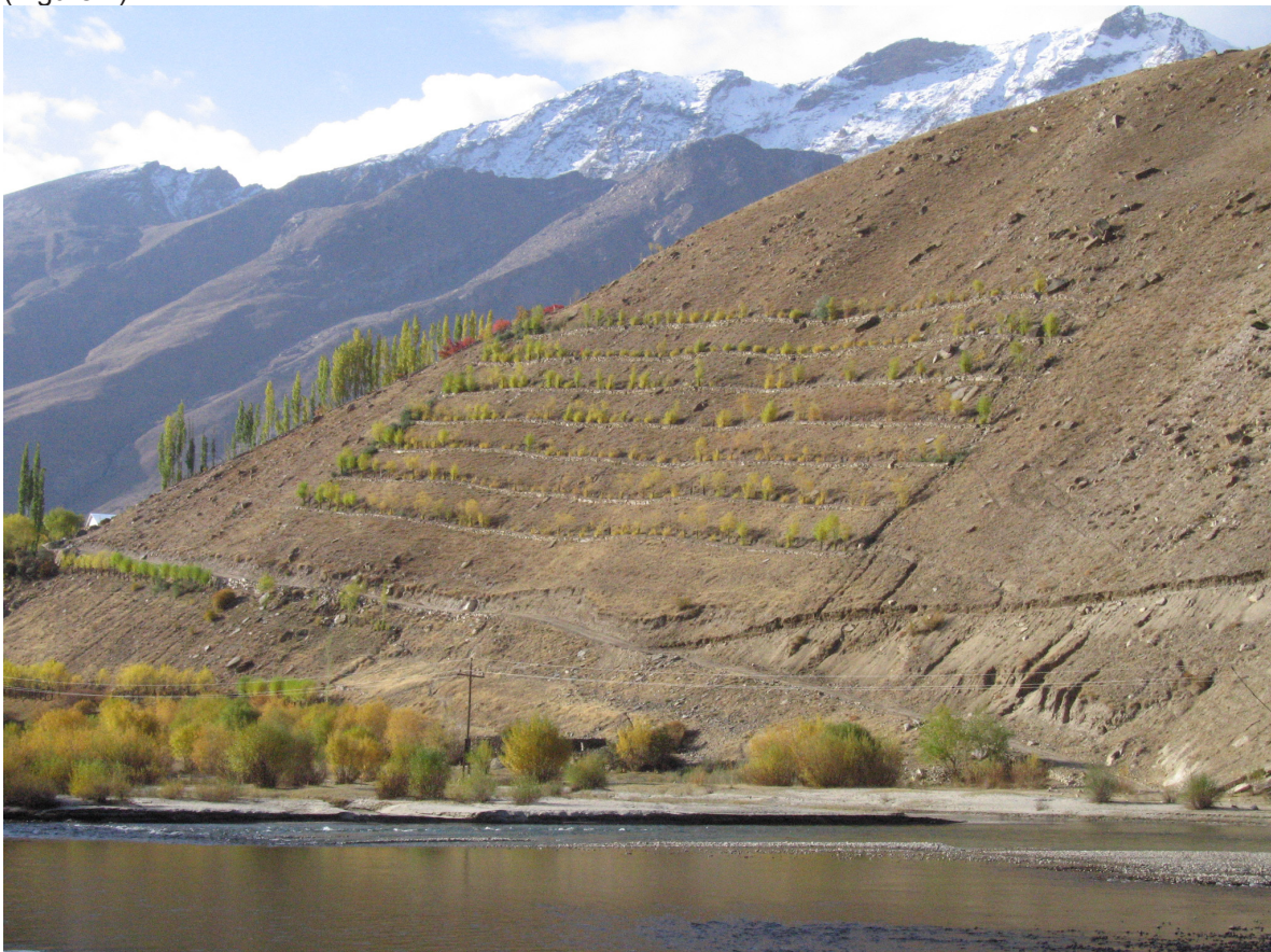
Fig. 2: Forest planting in Tajikistan.

During the 20 th century deforestation was increasing, both for producing timber and getting more grazing land. This deforestation contributed largely to increased land degradation. Nowadays on several places around and in the Fergana Valley efforts are made to increase the forested area (Figure 2).