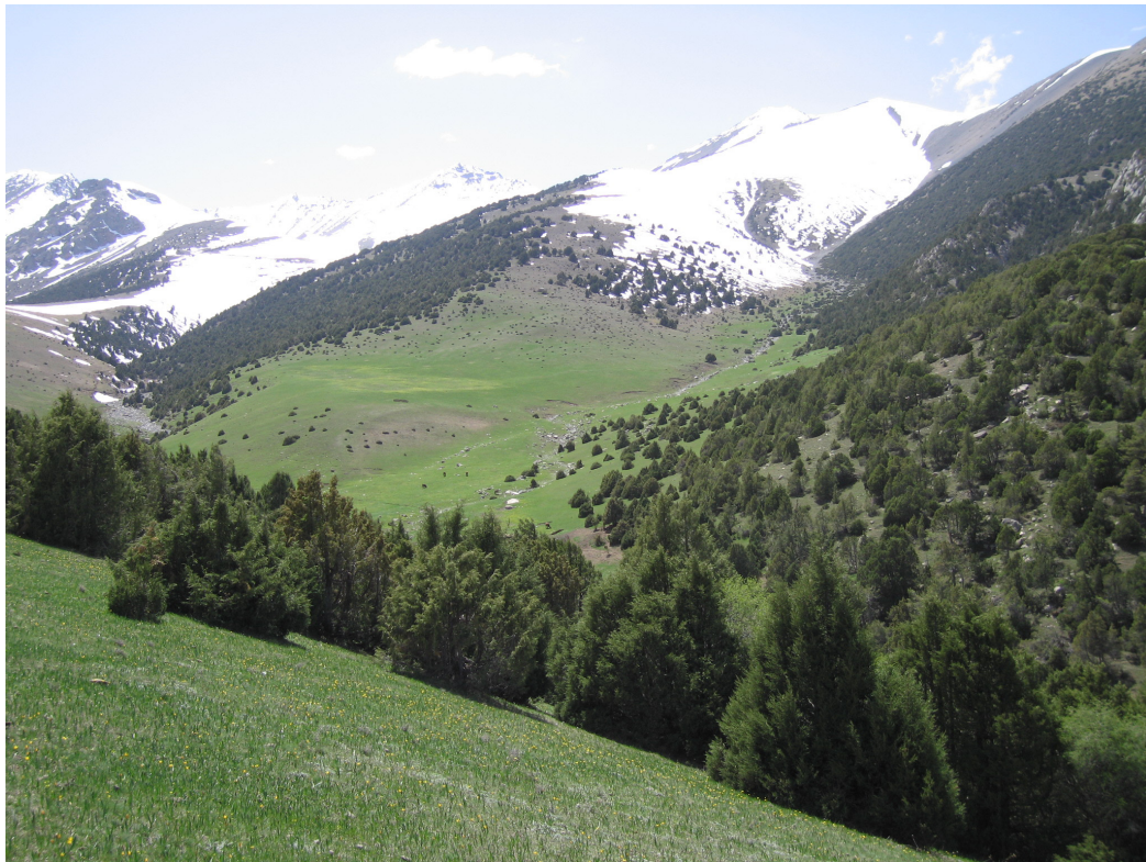
Fig. 8: An area with a high biodiversity value (Gauyang, Kyrgyzstan).

Protection of biodiversity in and around the Fergana Valley gets an extra dimension as many endemic species could develop in the mountain areas – it can be considered as a world in heritage. In many TEMP monitoring sites these endemics were found. Securing grazing activities at a certain level will help to protect these species. Both intensification of grazing and land abandonment will threaten the existence of the established population. Also farmer communities are dependent from income from grazing. Alternative sources of income should be arranged before grazing activities will be limited or in some areas forbidden.