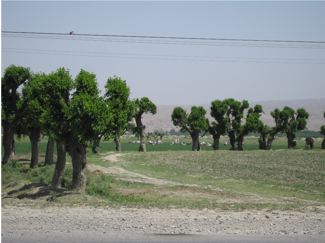
Fig. 9: Agriculture in the Fergana Valley.