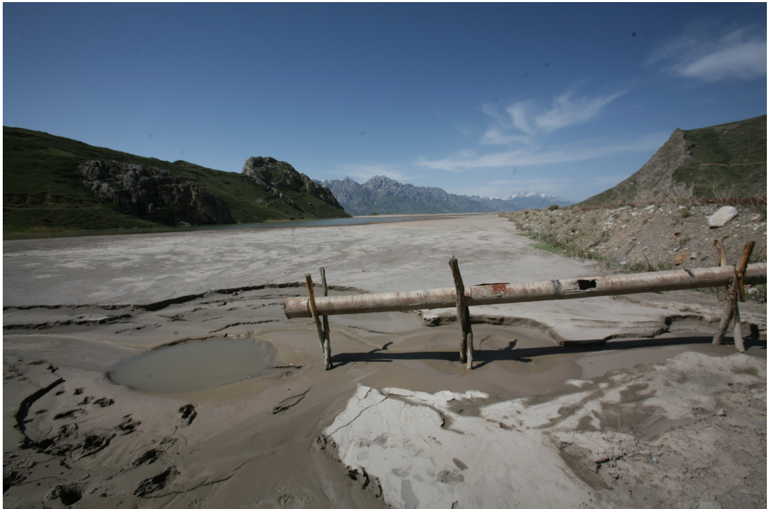
Fig. 11: Tailing in Khaidarkan (Kyrgyzstan).