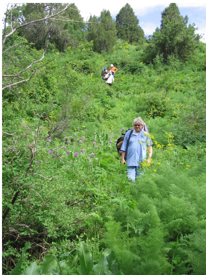
Fig. 7: Encroachment in Sary Chelek National Park (Kyrgyzstan).