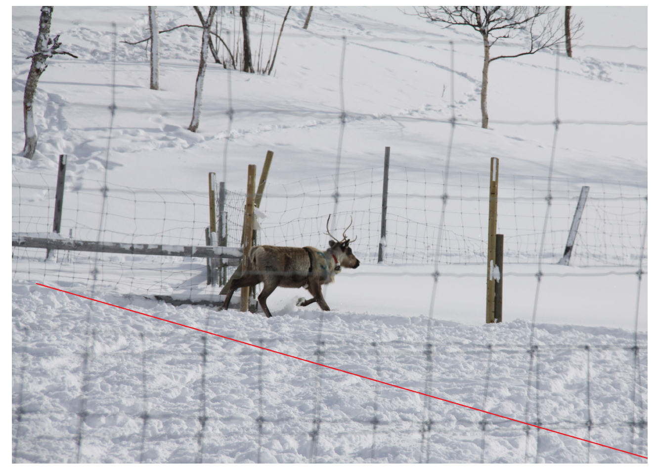
All reindeer crossed the virtual fenceline (here indicated in red) and ran out of the enclosure, as the physical fence was opened.

Instantaneous sampling of each animal's behaviour was performed using a predetermined ethogram of behaviours in five minute intervals. Feed was provided once a day and animals were gathered and caught for adjustment of NoFence collars every day during the test periods.