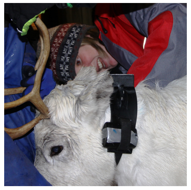
A reindeer is instrumented with a NoFence of prototype 2 collar, Tverrvatnet Mo i Rana, 2013.

Two prototypes of the NoFence system were tested; prototype 1 in March 2011 and prototype 2 in November 2013. Experiments were performed within the same reindeer enclosure in Tverrvatnet, Rana municipality. We instrumented groups of 6-8 reindeer with the NoFence collars and observed their behaviour and reactions towards a virtual fencing line, set just inside one end of the visual, physical fence (picture 2).