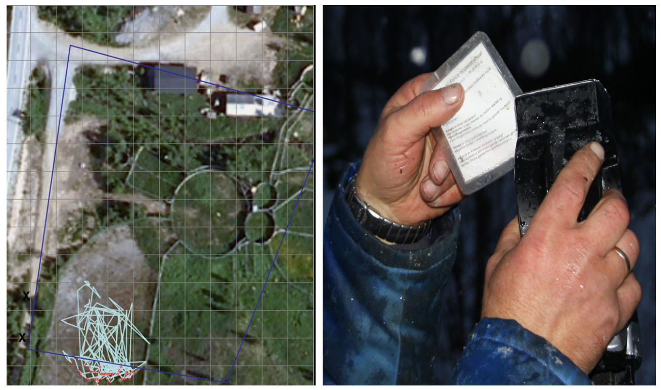
Physical fencing system and virtual fenceline (blue line) set by GPS endpoints in each corner. The line which animals could cross was just within the lower end of their experimental enclosure.