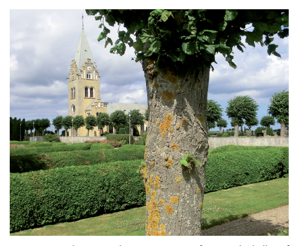
Figure 2. Epiphytic population consisting of one single thallus of X. calcicola on a Tilia sp. (Östra Nöbbelöv church).

The populations found on bark vary in size from 1 to ca 200 thalli (Fig. 2–5). All bark populations are small (1–24 thalli), except one (Skegrie churchyard, Fig. 5). Two are rediscoveries at localities where it has previously been collected on bark and 12 are new discoveries. In total,