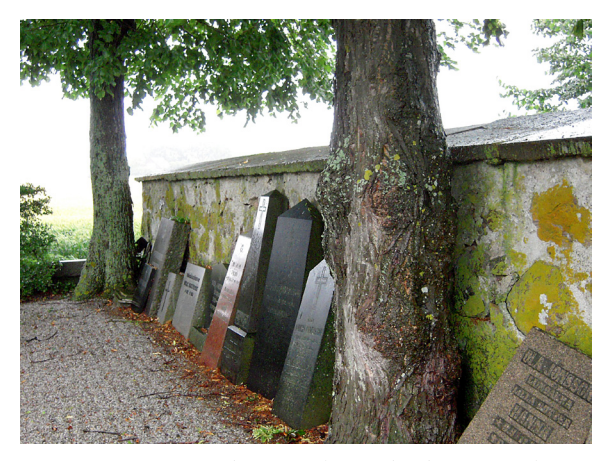
Figure 3. Two trees ( Tilia sp.) with X. calcicola growing close to the churchyard wall with a large X. calcicola population (Hofterup church).

we have observed ca 300 thalli of X. calcicola growing on bark. At six of the previously known localities, including one where it was reported relatively recently (Malmqvist 2000), the species was not found (Table 1). At all localities except one X. calcicola in addition to bark was present on the surrounding churchyard walls. The only exception was Mölleberga churchyard (Fig. 4B), where there were virtually no lichens on the wall, indicating that it had been recently whitewashed (Lindblom and Blom 2010). The wall populations at localities where X. calcicola grows on bark were, on average, larger than other wall populations (1706 ± 2559 versus 489 ±1360 thalli), and a larger proportion of them possessed thalli with apothecia (71.4% versus 50.5%). Thus, localities with tree populations seem to have important source populations on walls in relation to localities with populations on walls only. Seemingly suitable churchyard trees were present at most of the investigated localities, indicating that colonization of X. calcicola on trees is a rare event. The trees harbouring X. calcicola were always growing close to the wall habitat, up to \leq 5 m (Fig. 3). These results add to the hypothesis that trees are actually suboptimal habitats for X. calcicola. Hence, bark populations are sinks (sensu Dias 1996) sustained by continuous supply of diaspores from the connected source population on walls (sensu Dias 1996).