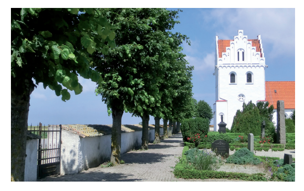
Figure 5. The largest bark population found, with approximately 200 thalli growing on bark of 22 Tilia sp. trees. The surrounding wall population is also very large (Table 1) (Skegrie church).

Our results support the hypothesis that establishment on trees are dependent of wall populations in close vicinity, continuously bombarding the suboptimal tree habitats with diaspores. The Mölleberga churchyard locality, where the churchyard wall has recently been whitewashed and the wall population are now without X. calcicola