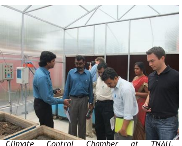
Climate Control Chamber Coimbatore, India

In recent years a numbers of technologies have been developed to study the impact of climate change on agricultural systems. Crop response to climate change could be studied by using a climate control chamber and data base generated using these facilities will be more realistic for impact assessment analysis under changing climatic conditions. Most of the research on plant response to climate change have been studies conducted under a controlled environment. Controlled climatic condition technologies have been successfully applied to study the response of plant to increasing temperature, green house gases and light quality variation.