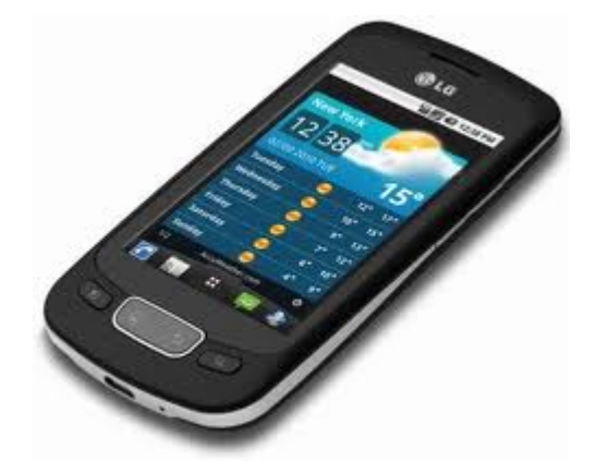
Figure: Selection of a smartphone for field use should give priority to battery capacity to allow full working days. Price is another relevant factor as field usage usually will be rough.

Although smartphones are still expensive, the availability of an open source operating system, the Android, is an advantage that any producer can use in their products. This is likely to push prices down quite rapidly and give way for easy affordability to Indian farmers.