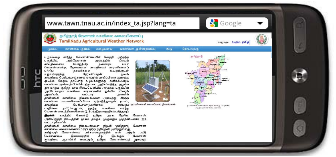
Figure: TamilNadu Agricultural Weather Network web page shown in a smartphone internet browser (in Tamil language)

Photo: Early detection of pest damage on rice leaves