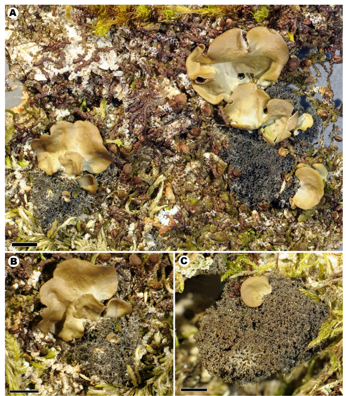
Figure 2. Ricasolia virens (all from Tønsberg 40924 , BG). A-C, dendriscocauloid cyanomorphs without or with chloromorph lobules (photosymbiodemes). Scale bars = 2 mm.

Whether the juvenile cyanolichen stage following ascospore dispersal is obligate in Ricasolia virens is not clear. Our observations may suggest that cyanomorphs are an integral part of the life cycle of the lichen association. However, large populations of R. virens chloromorphs have been studied in the field without any observations of cyanomorphs, which may suggest that germinating ascospores can associate with the green photobiont and form chloromorphs without a cyanomorphic stage (i.e., chloromorph \rightarrow germinating ascospore \rightarrow chloromorph). Alternatively, the lack of observations of a cyanomorph stage in these populations could well be explained by the cyanomorph being ephemeral and thus rarely observed.