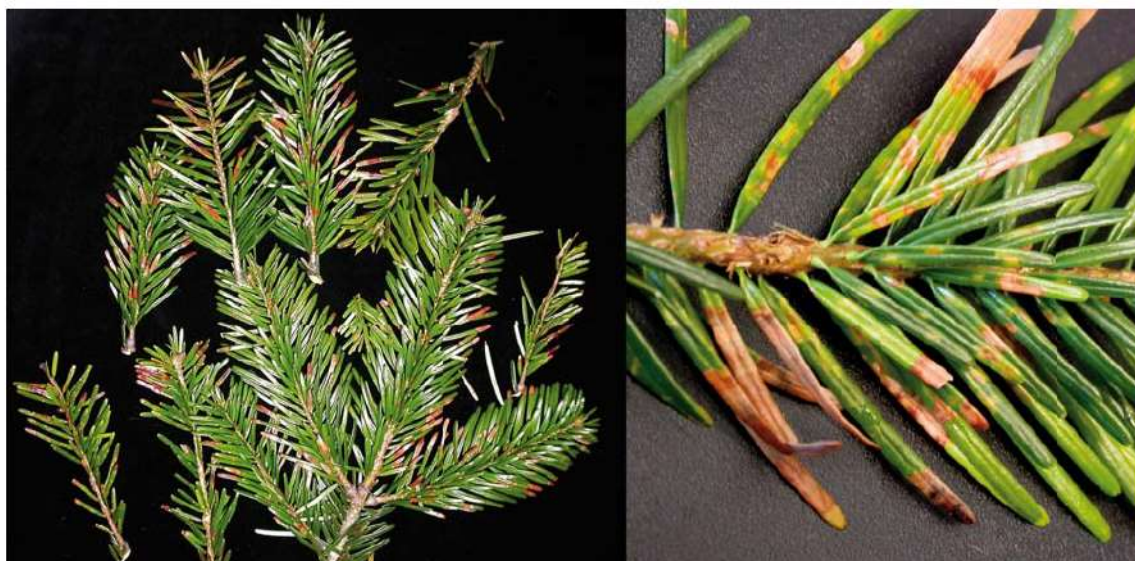
Fig. 1 Nordmann fir ( Abies nordmanniana ) with symptoms of current season needle necrosis (CSNN).