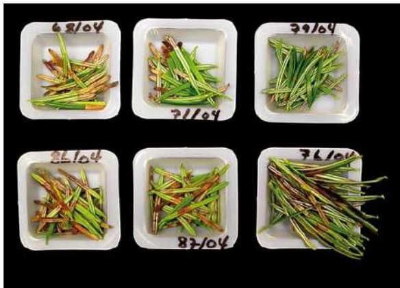
Fig. 3 Needles of nordmann fir ( Abies nordmanniana ) with symptoms of current season needle necrosis (CSNN). The needles were collected from five farms (six samples) in Rogaland county in early October 2004.