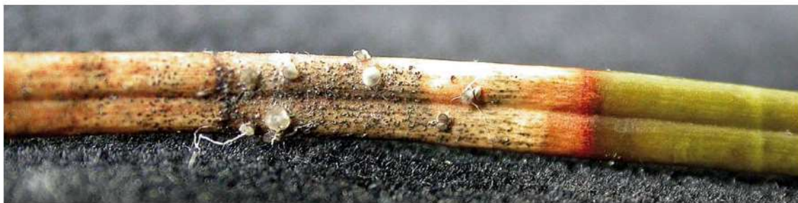
Fig. 8 Mollisia sp. on a nordmann fir ( Abies nordmanniana ) needle collected in Rogaland county in January 2007.

It may be concluded from our investigations in Norway and Austria that we have clear indications that CSNN is caused by K. abietis .