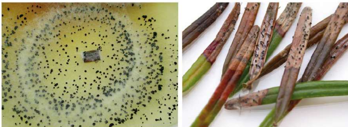
Fig. 4 Petalotiopsis sp. on growth medium (PDA) (left) and incubated needles of nordmann fir ( Abies nordmanniana ) with current season needle necrosis (CSNN) symptoms (right).