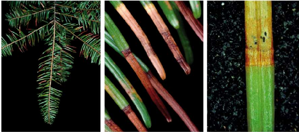
Fig. 2 Current season needle necrosis (CSNN) due to Kabatina abietis on grand fir ( Abies grandis ) in Austria.