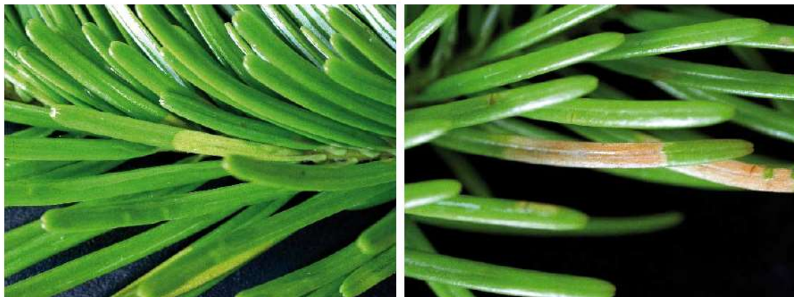
Fig. 6 Initial symptoms of current season needle necrosis (CSNN) on nordmann fir ( Abies nordmanniana ). Symptoms developed earlier in 2007 (photo to the right, June 28) than in 2006 (photo to the left, July 10). Both samples came from the same location in Rogaland county.

CSNN has thus far not been problematic in Norwegian Christmas tree fields, but we have received samples occasionally during 2004 to 2007. On the upper side of the needles from a majority of these samples, there were densely situated acervuli (Fig. 7). Occasionally greyish spore masses oozed out from the acervuli after incubation. Isolation on PDA directly from the spore masses yielded a culture identical to the culture in Fig. 5. The acervuli had textura angularis as described for K. abietis by