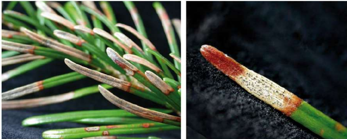
Fig. 7 Acervuli (black spots) on the upper surface of needles from nordmann fir ( Abies nordmanniana ) with symptoms of current season needle necrosis (CSNN). The samples were collected in Rogaland county in January 2007 (left) and in April 2007 (right).

Butin and Pehl (1993), and the morphology of the spores corresponded well with their description. Butin and Pehl (1993) reported that K. abietis mainly form on the lower side of the needles (hypophyllous). As far as we observed, acervuli did not appear on the upper surface (epiphyllous) until the necrotic areas changed from brown to more greyish. Thus, acervuli seemed to form later on the upper side of the needles than on the lower side.