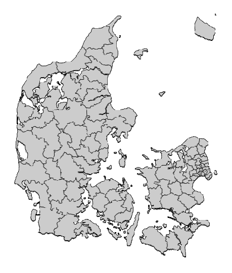
The 98 municipalities in Denmark

32 of the former municipalities did not merge into larger units, either because they already had merged or had a population larger than 20,000 or because they signed a cooperation agreement with a larger municipality.