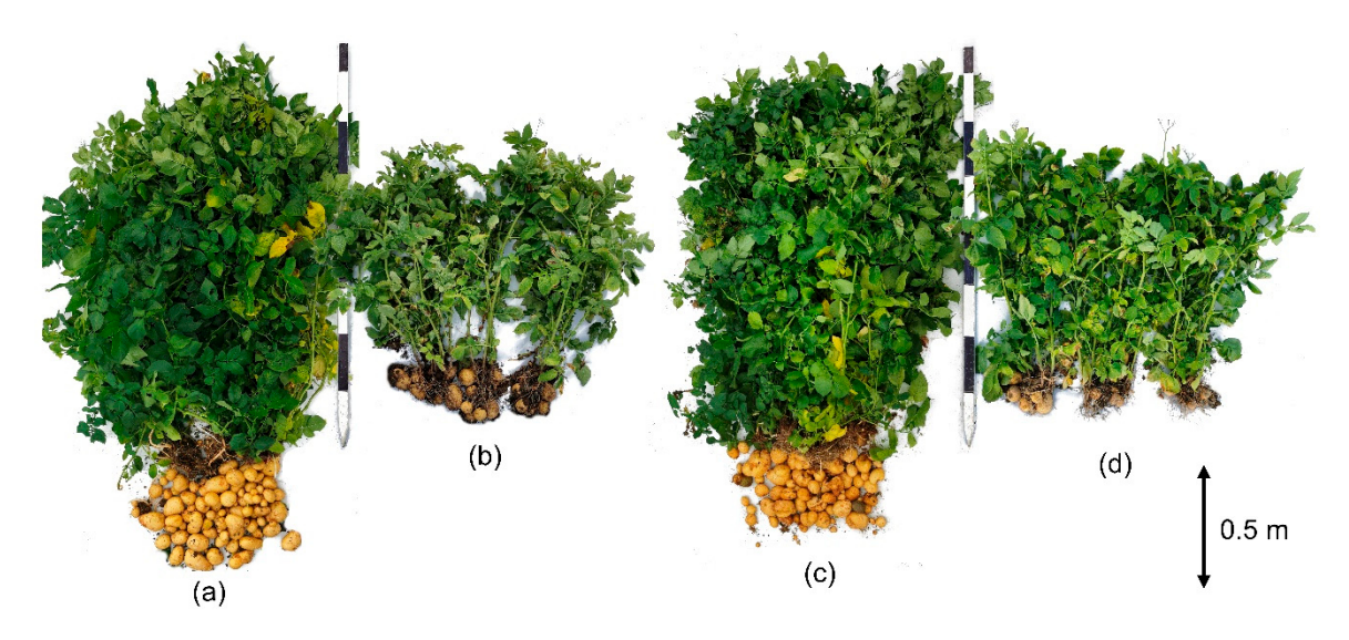
Figure 1. Potato plants and tubers (three per group) produced in the wood-fiber-based hydroponic system ( a , c ) and in the field ( b , d ).

Compared to the field reference, the plants grown hydroponically were approximately two times larger (Figure 1). The difference in biomass between the two tested substrates was minimal, with 150 cm long shoots and 9 and 8 shoots for HUN and PIN, respectively. Higher yield was observed when growing in PIN fiber (1877 g plant<sup>-1</sup>) than when growing in HUN (1537 g plant<sup>-1</sup>) (Table 1). Compared to the field-grown potatoes, the yields of the hydroponic production were larger by more than 200% (Table 1). Dry matter in the hydroponic-grown tubers was considerably lower than in the field-grown tubers, yet DM production on a per plant basis was still higher in the hydroponic system.