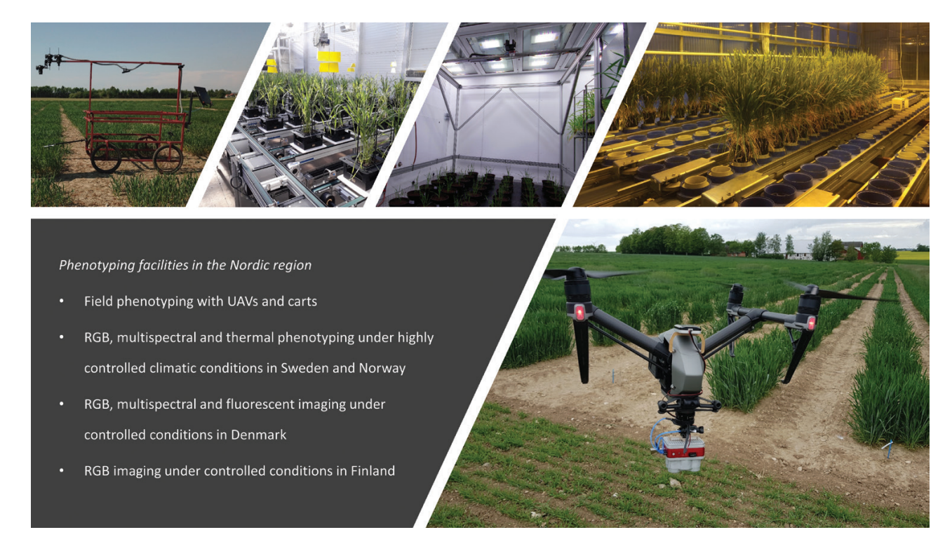
Fig. 3. Examples of phenotyping facilities in the Nordic region.

more accurate root image analysis, thus significantly reducing the time required for root measurement (Han et al., 2021). With these approaches, root traits for deep nitrate uptake under Nordic conditions have been identified (Wacker et al., 2022). Such facilities could be used to test root establishment and uptake of nitrogen in cereals, which can be important to screen for winter varieties and vigour in general (S. Chen et al., 2019). Estimation of root biomass and depth can help in breeding of more drought-tolerant crops with increased nutrient uptake. Furthermore, a larger root system can increase the carbon sequestration potential and mitigate elevated CO2 levels (Kell, 2011). There is, however, a clear need for an advanced facility in the northern part of the Nordic agricultural region, as this would give a better understanding of root development and architecture in more extreme conditions. In addition to the identification of new adapted cultivars, adjustments of management practices such as sowing time might be required to better match the new climate conditions. In general, there is a need for HTP and precise phenotyping efforts evaluating the impact of different management practices.