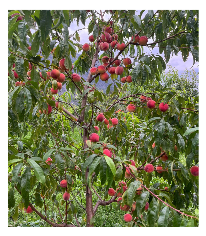
Figure 4. Redhaven peach at Lærdal.