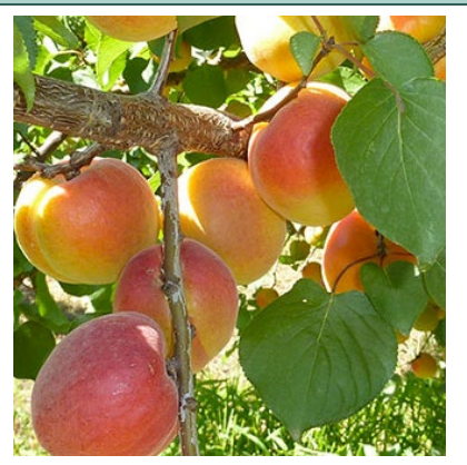
Origin: INRAE, France Flowering: early Ripening: mid late Partly self-sterile Large fruits