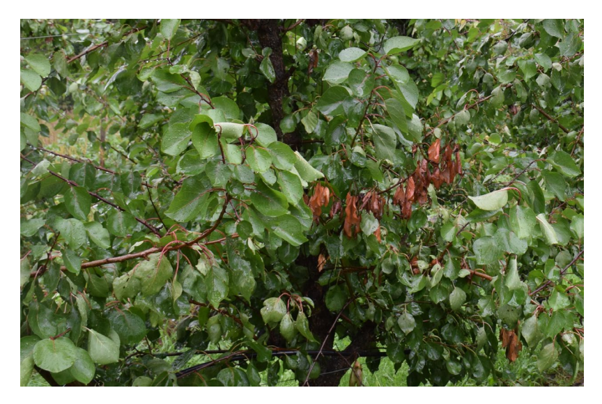
Figure 3. Dye back of the apricot shoots in Lærdal.

Another major disease is apricot scab. Scab on apricot is caused by the fungus Cladosporium carpophilum. Black spots reduce marketability of the fruits. If the disease is not controlled, large areas of the fruit will show lesions, exposing the pulp to many fungi which cause fruit rots. Twigs and leaves may also be infected, but fruit infection is more common.