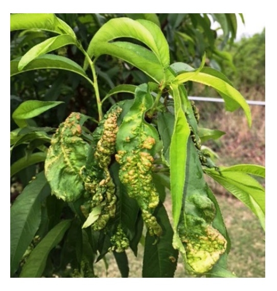
Figure 5. Symptoms of Peach leaf curl.

Disease and pest control. Peach Leaf Curl. The most serious disease of peaches and nectarines is Leaf curl, caused by the fungus Taphrina deformans. Leaf curl attacks blossoms, leaves, current year's twigs, and fruit. Infection is promoted by cool, wet weather during early spring that retard tree growth more than growth of the fungus. A reliable strategy for Leaf curl pest control in a wet, suboceanic climate (Western Norway) is not yet established. The most successful control of Leaf curl was done at Ullensvang in 2010 with multiple treatments with copper and Delan from early April until June and removal of infected leaves.