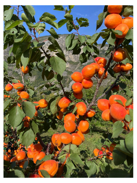
Figure 2. Bearing apricot tree in Lærdal. Cultivar Goldrich.

As a result of cultivar evaluation in commercial fields, Kuresia, Bergeval, Vertige and Orangered were selected as the most favourite cultivars in Lærdal.