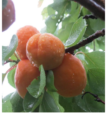
Origin: WSU, US Flowering: mid early Ripening: mid late Self-sterile Large fruits