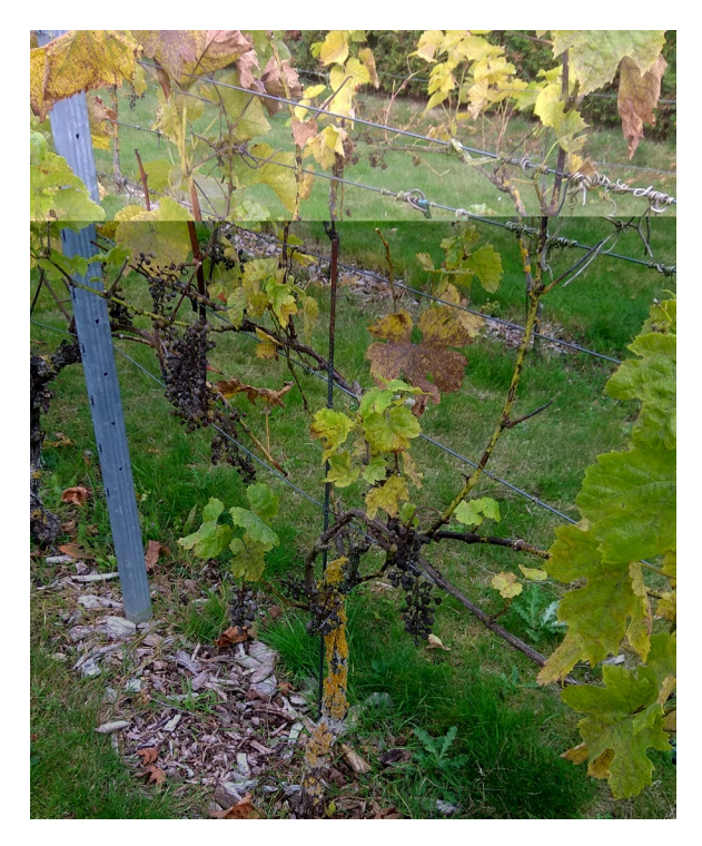
Figure 7. Mildew damages of grape leaves and clusters.

It is known that commercially grown grapes are the most chemically treated plants among all fruit and berry crops produced in the EU.