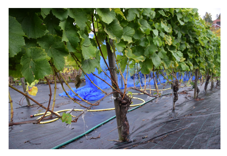
Figure 6. Grapes planted on black plastic cover in A. Syversen plantation.

Leaves that give shade to the clusters must be removed. Also, optimal planting distances (3 m between rows) for the fruiting wall which is usually maintained up to 1,5 - 2 meters high in Nordic conditions should be chosen. Narrower interrow gives shading to neighbouring plants and decreases berry quality and slows down maturation processes.