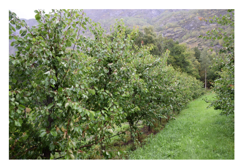
Figure 1. Commercial apricot orchard in Lærdal.

The newest plantings at Lærdal included French cultivars from INRA breeding program self-fertile, late flowering Bergeval and self-fertile Vertige, German cultivar Kuresia, Canadian cultivar Hargrand and Goldrich from US.