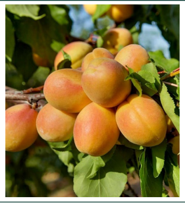
Origin: WSU, US Flowering: early Ripening: late Large fruits Self-fertile Photo:

Photo: <a href="https://catalogue.starfruits-diffusion.com/variete/vertige/">https://catalogue.starfruits-diffusion.com/variete/vertige/</a>