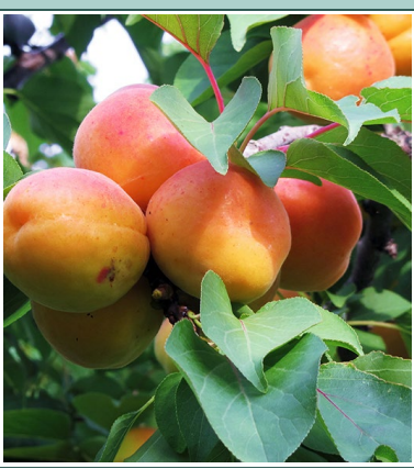
Origin: US Flowering: early Ripening: early Medium size fruits Self-sterile Photo: