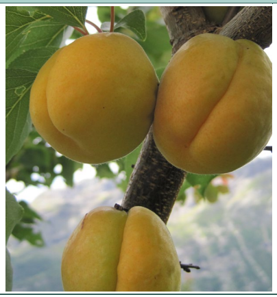
Origin: US Flowering: early Ripening: mid late Self-fertile Medium size fruits Resistant to leaf spot.