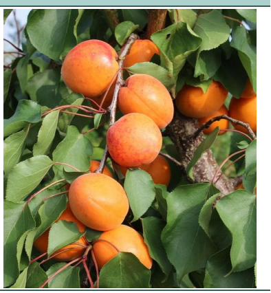
Origin: INRAE, France Flowering: late Ripening: mid-season Large fruits Self-fertile

Photo: <a href="https://www.graeb.com/">https://www.graeb.com/</a> en/range/apricots/maturitytable/candide-s/#lightbox[1953]-2